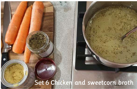
Set 6 Chicken and sweetcorn broth

In a pot with water, add dried chicken stock and three pinches of herb mix.