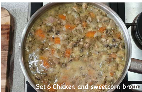
Set 6 Chicken and sweetcorn broth

Bring the broth to the boil and cook until the chicken is cooked.