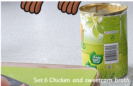
Set 6 Chicken and sweetcorn broth