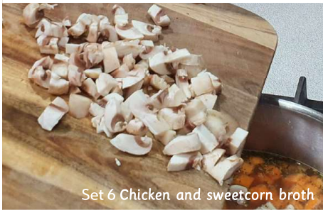
Set 6 Chicken and sweetcorn broth