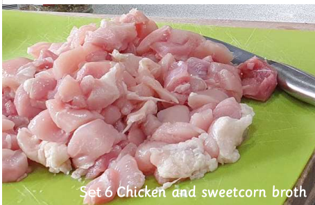
Set 6 Chicken and sweetcorn broth

Chop the chicken into little bits. Put them in the pot.