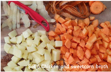
Set 6 Chicken and sweetcorn broth

Peel the carrots and potatoes and chop. Put them in the pot.