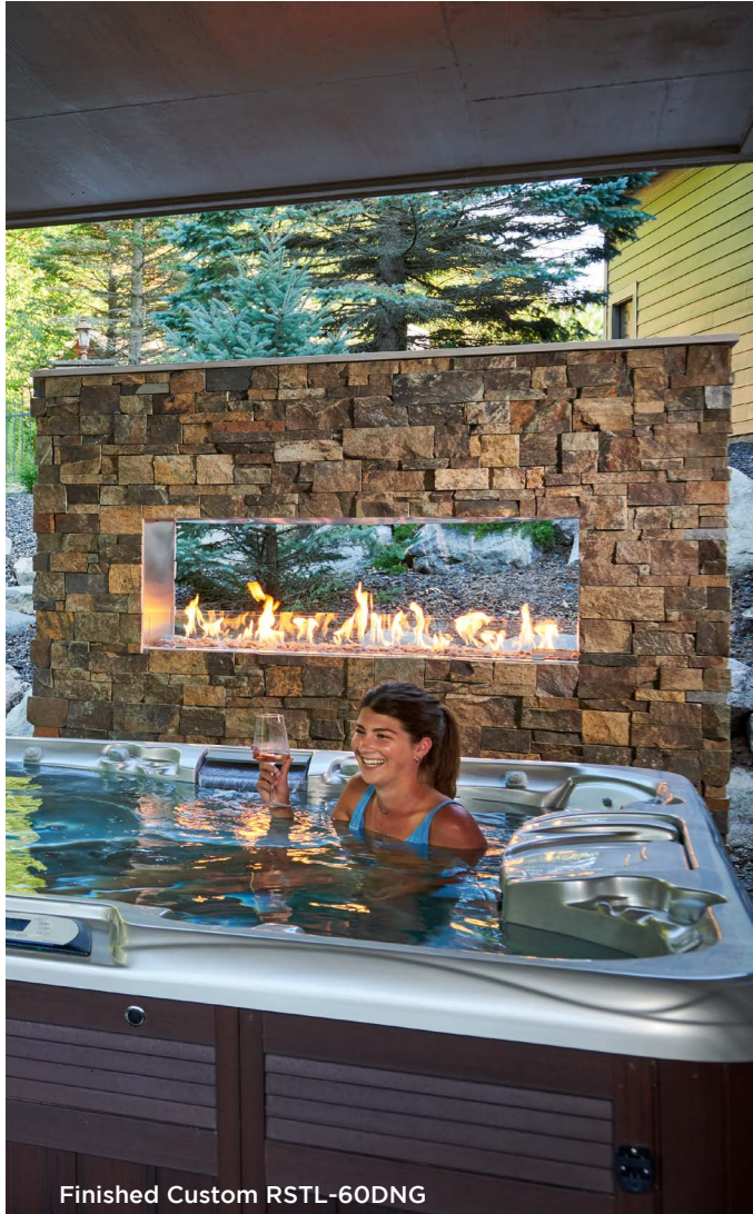
Finished Custom RSTL-60DNG