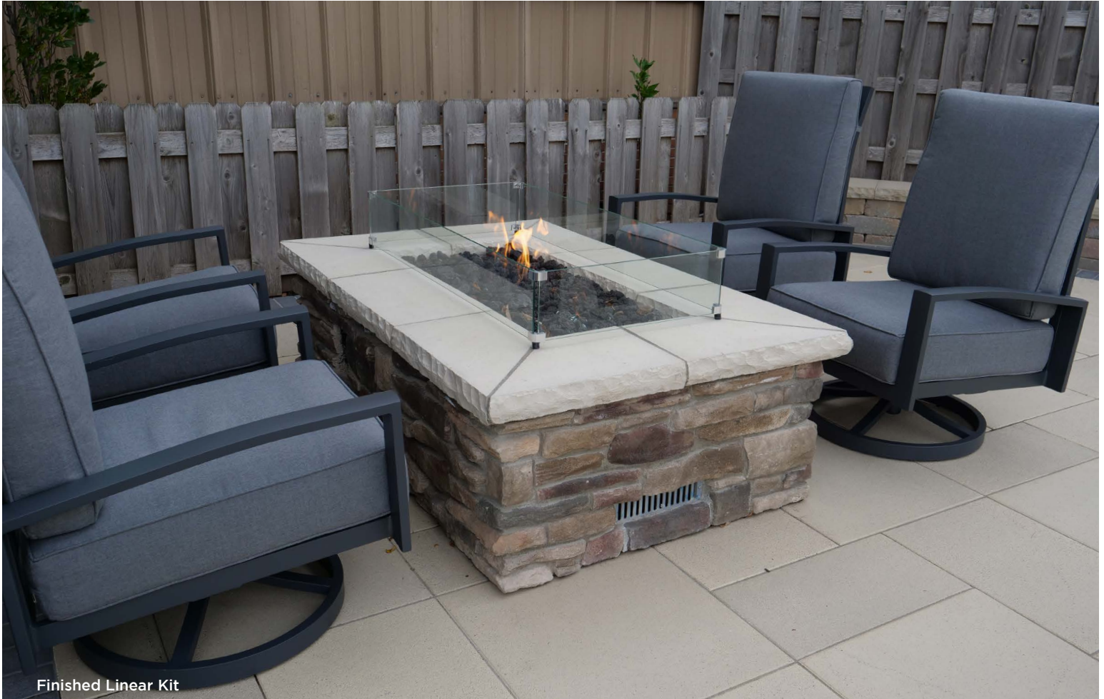
Finished Linear Kit