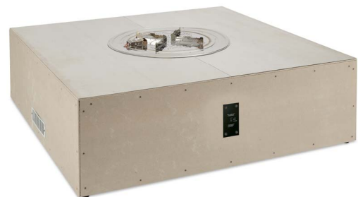
Square kit with included components.