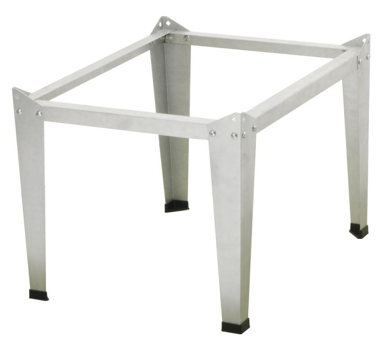
Place the plastic stand feet on the stand legs. The stand is now complete.

Place the Studio Pro 14 on the stand as shown and secure the kiln base to the stand. Your Studio Pro 14 base came with 4 nuts and bolts for this purpose. The kiln MUST be secured to the stand as shown. Failure to secure the kiln to the stand will result in instability which may cause property damage or personal injury.