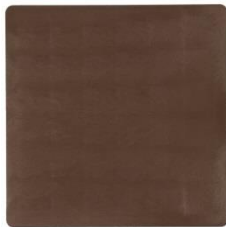
(2) Bats (B75, B12)