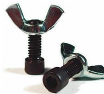
Bat Pins Warranty Card