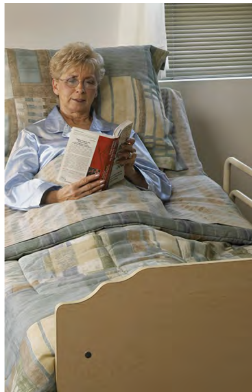
1. Human Care Floorline Bed