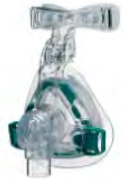
2. RESMED Mirage Activa LX