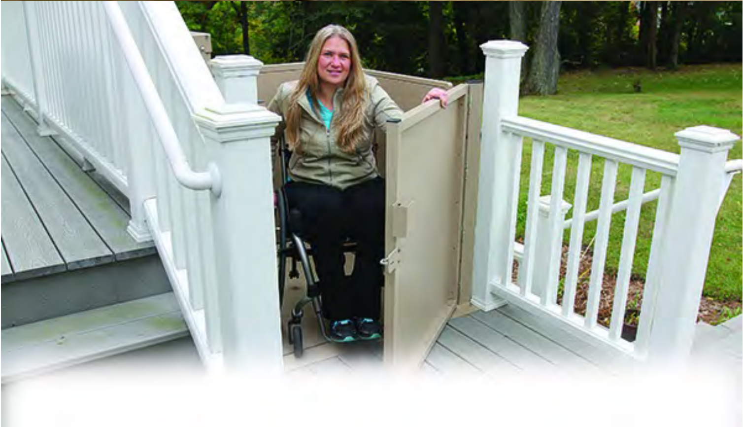
1. Barrier Free Bathroom Modification