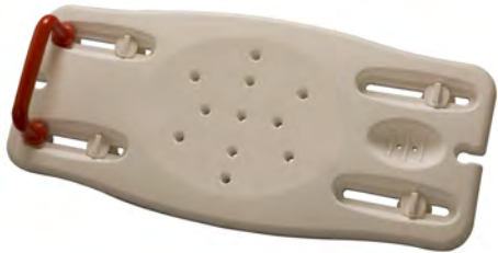
1. Guardian Transfer Bench