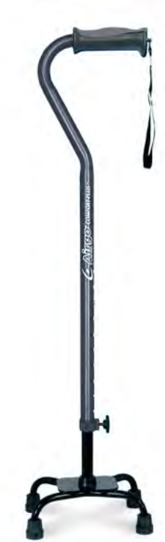
1. AMG Wood Canes