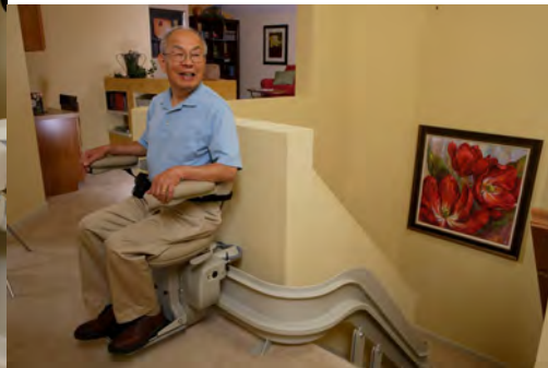
1. Bruno 2010 Elite Straight Stair Lift