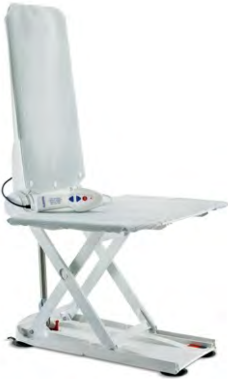
1. Human Care Bath Board