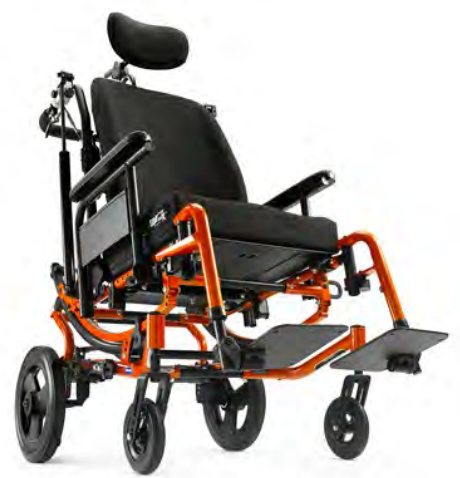
1. Invacare T7A Rigid Wheelchair