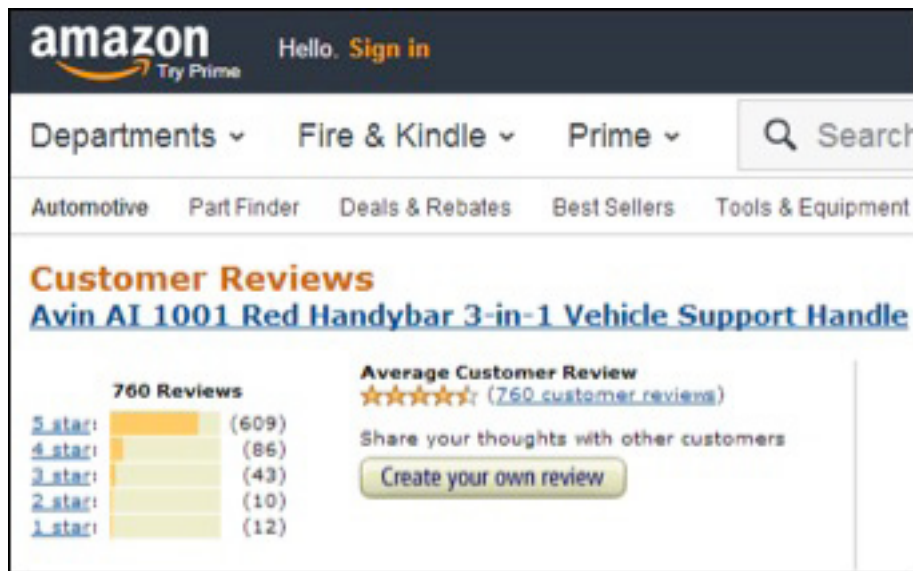
Table 2. Snapshot of part of the Amazon web page consulted 1

For this review, no member of the intended population was directly involved. When the Amazon website 1 was consulted as of July 28, 2014, a total of 760 customer reviews were published about the Handybar. Customer reviews were highly positive with 609 persons rating this product five stars out of five (see table below).