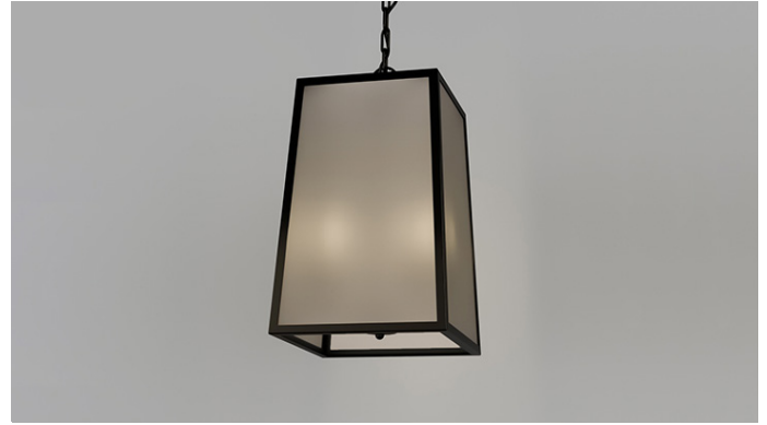
2 Light / Frosted LR.i03.73.002 FR