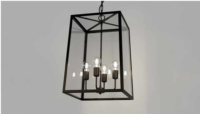
4 Light / Clear LR.i03.73.003