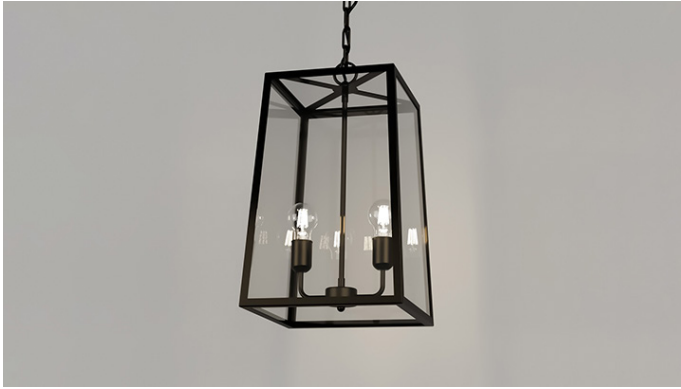
2 Light / Clear LR.i03.73.002