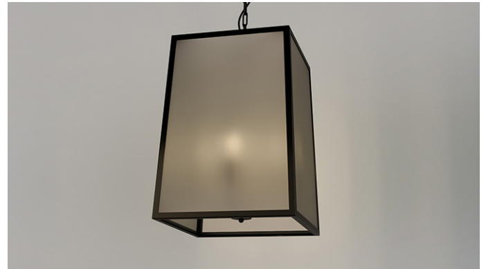
4 Light / Frosted LR.i03.73.003 FR