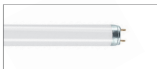
LINEAR BLUE UVA