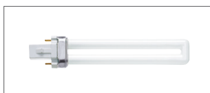
DULUX® S BLUE UVA