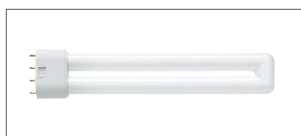
DULUX® L BLUE UVA