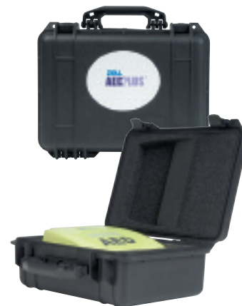
A Rugged Case for the First and Only Full-Rescue AED