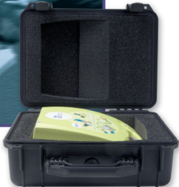
Large Case (19" x 15.4" x 7.6") (48.3 cm x 39.1 cm x 19.3 cm)

Unbreakable, Watertight, Dustproof, Chemical Resistant, and Corrosion Proof.