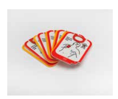
Training Electrode Set For use with the LIFEPAK CR2 Trainer or Demo Unit. Includes 5 sets of pads.