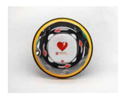
Rotaid Solid Plus Heat Wall Cabinet with Heat and Alarm