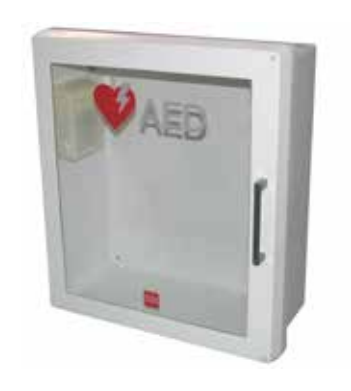
LIFEPAK CR2 AED Surface Mount Cabinet with Alarm