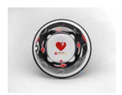
Rotaid Plus Wall Cabinet with Alarm