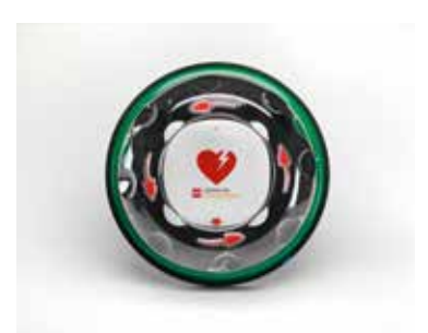
Rotaid Solid Plus Wall Cabinet with Alarm

11996-000443 (Red) 11996-000444 (Yellow)