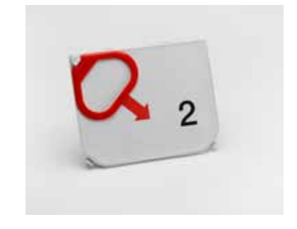
Replacement Electrode Tray Cover For use with the LIFEPAK CR2 Trainer or Demo Unit