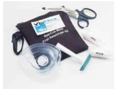
Ambu<sup>®</sup> Res-Cue Mask<sup>®</sup> First Responder Kit

Includes 2 sets of disposable vinyl gloves, 1 reusable mouth barrier mask with valve and filter, 1 disposable razor, 1 disposable antimicrobial wipe, and 1 pair of trauma scissors.