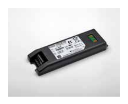
LIFEPAK CR2 AED Lithium Battery Includes 1 battery and replacement