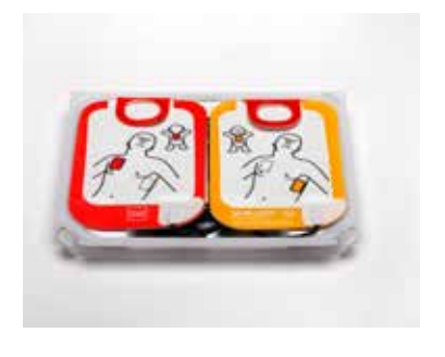
QUIK-STEP<sup>™</sup> pacing/ECG/defibrillation electrodes—4 year

Includes electrode cover, 1 set of adult/paediatric electrodes and replacement instructions.