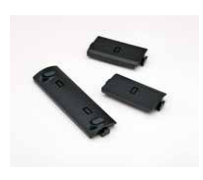
Replacement Trainer/Demo Battery Compartment Covers