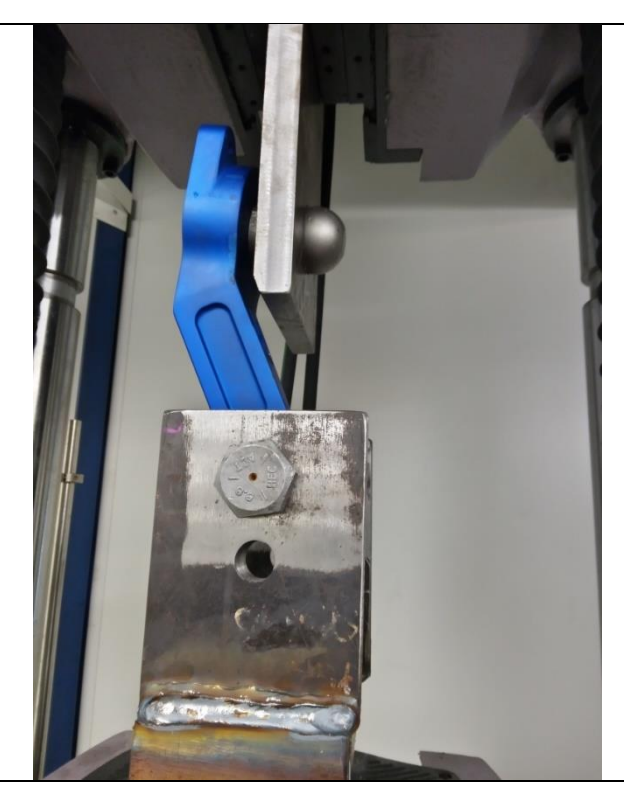
Figure 3: Photograph of the Trailer Hitch component during load test.