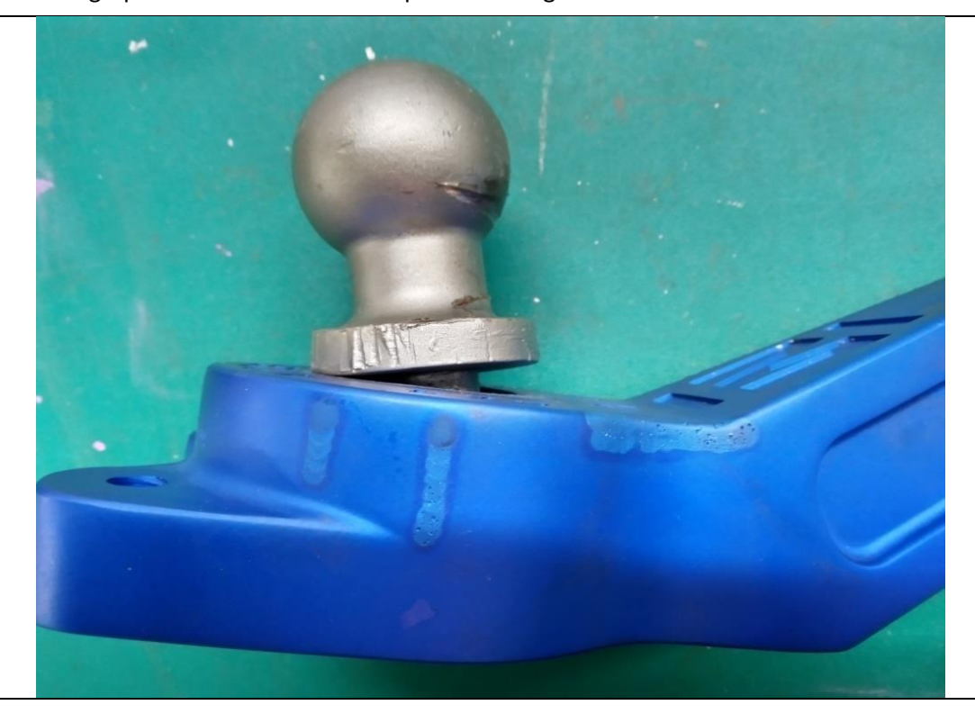
Figure 4: Photograph of the Trailer Hitch component after load test.