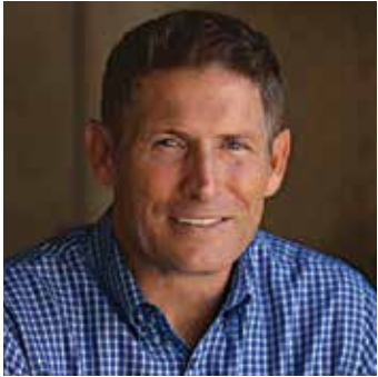
Steve Young Founder & Chairman Forever Young Foundation