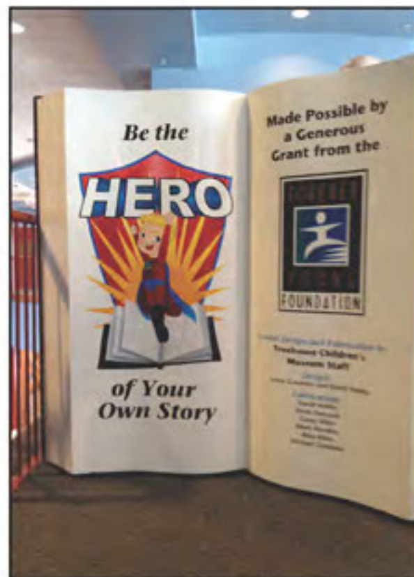
Treehouse Museum, Ogden, Utah