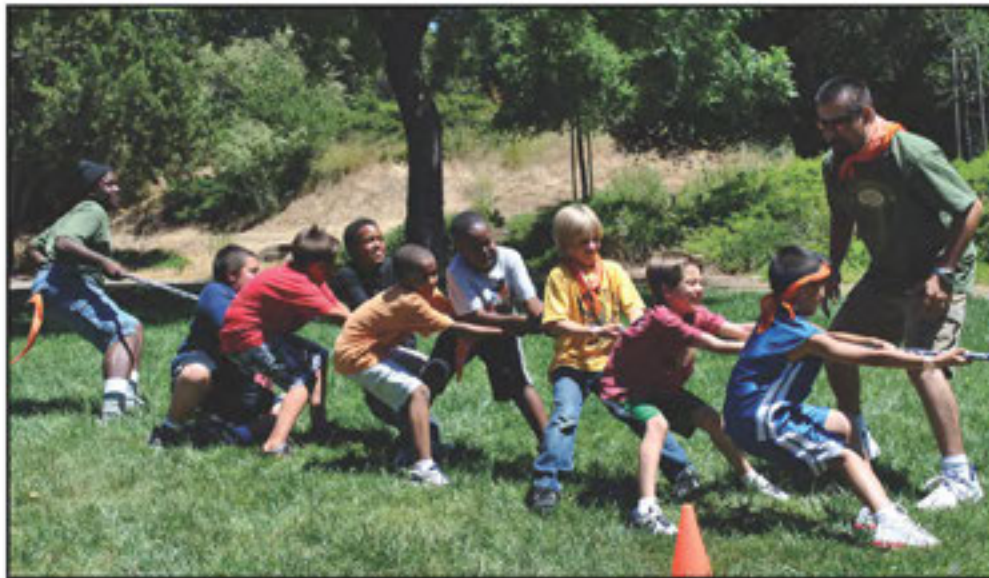
Children enjoying summer camp with the Taylor Family Foundation