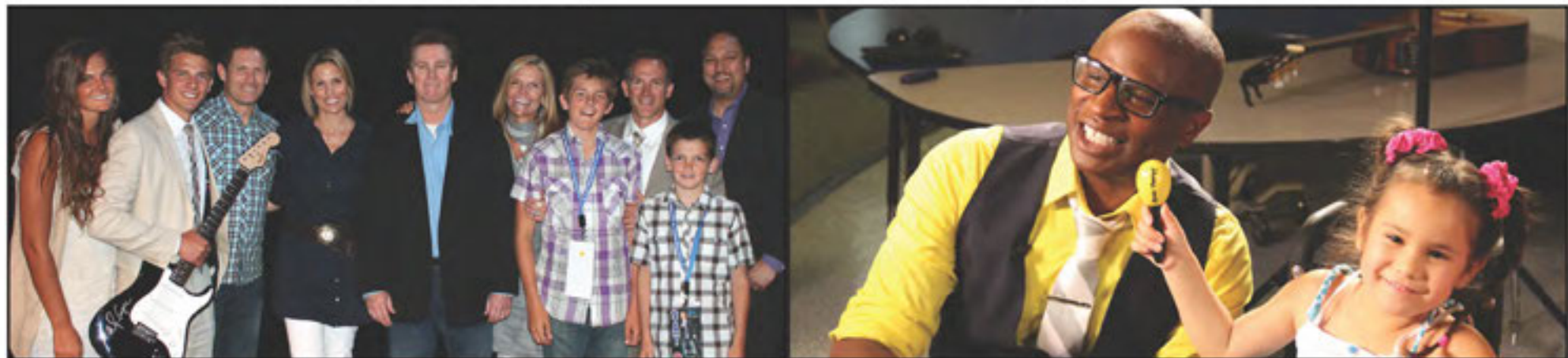
Singer Alex Boyé with a young patient at Primary Children's Hospital, Salt Lake City, Utah