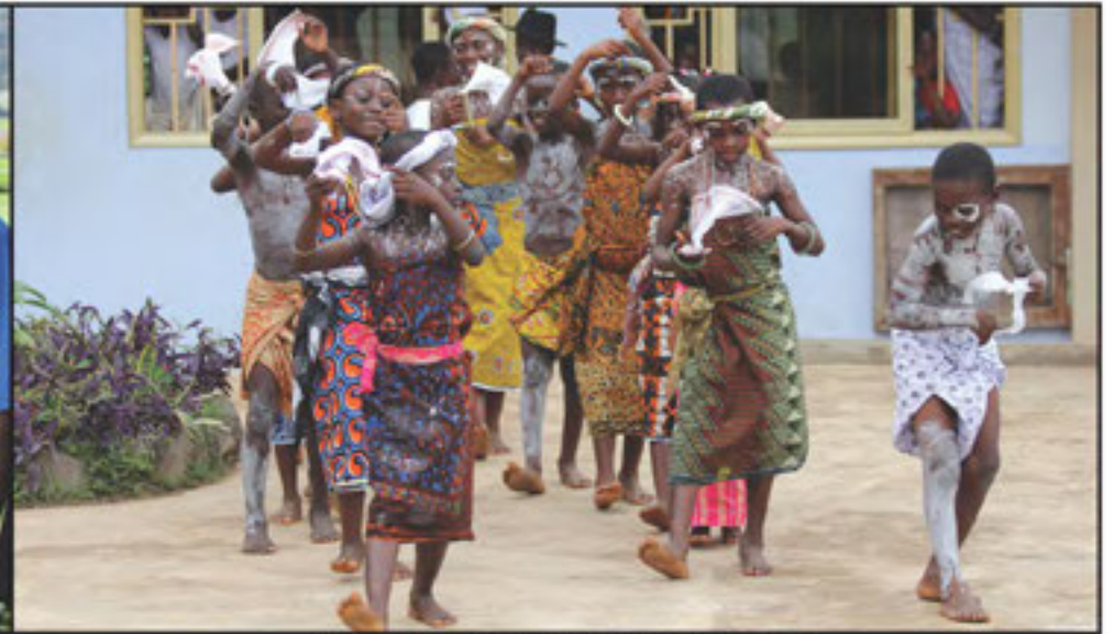
Forever Young International School, Ghana, Africa