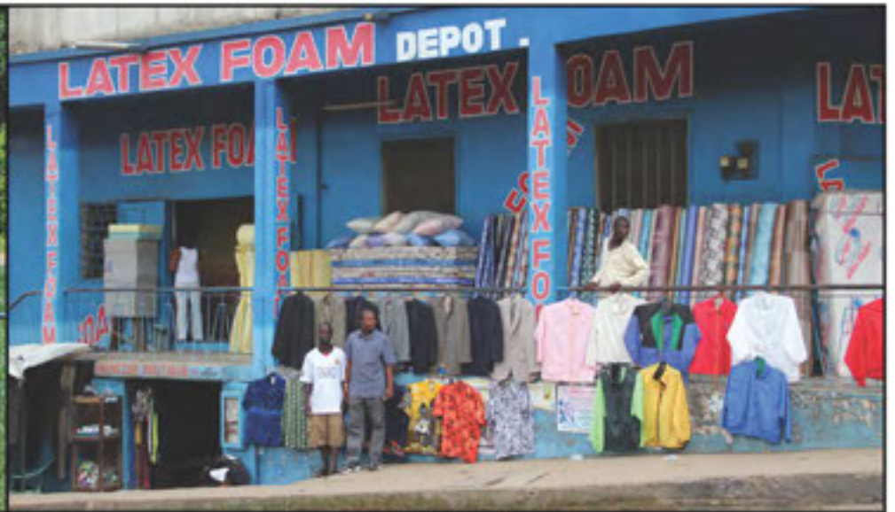
Microcredit enterprise, Ghana, Africa