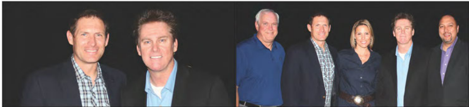
Steve Young and Brian Regan