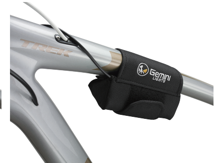
Soft case battery