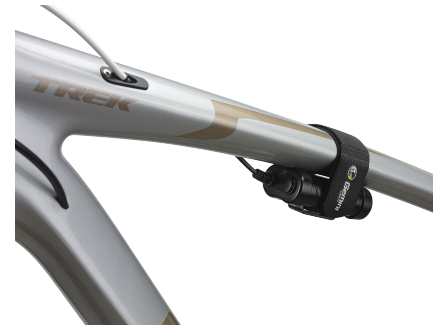
Hard case battery