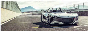
Above: VUHL 05 weighs just 725kg. Below: race-bred interior; jet fighter-style switchgear

RIP the BMW 3-series coupe, long live the 4-series. The 4 is a smart looker and comes with a plethora of petrol and diesel engines, and some four-wheel-drive models. Prices start at £31,575 for a 420d, with the 302bhp 435i top of the range until the M4 arrives. Expect convertible and Gran Coupe versions, too.