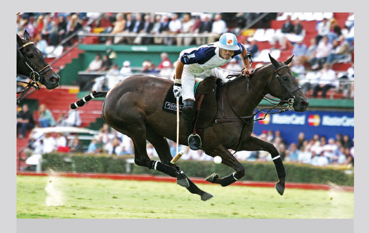
The great players seem to manoeuvre effortlessly around the pitch due to a lack of interference and minimal but accurate communication to the horse.

Only when you accept the extraordinary display of patience, tolerance, and trust that a polo pony (or any horse for that matter) shows will you ever truly aspire to ride with deserved respect and a real desire to constantly improve your horsemanship.