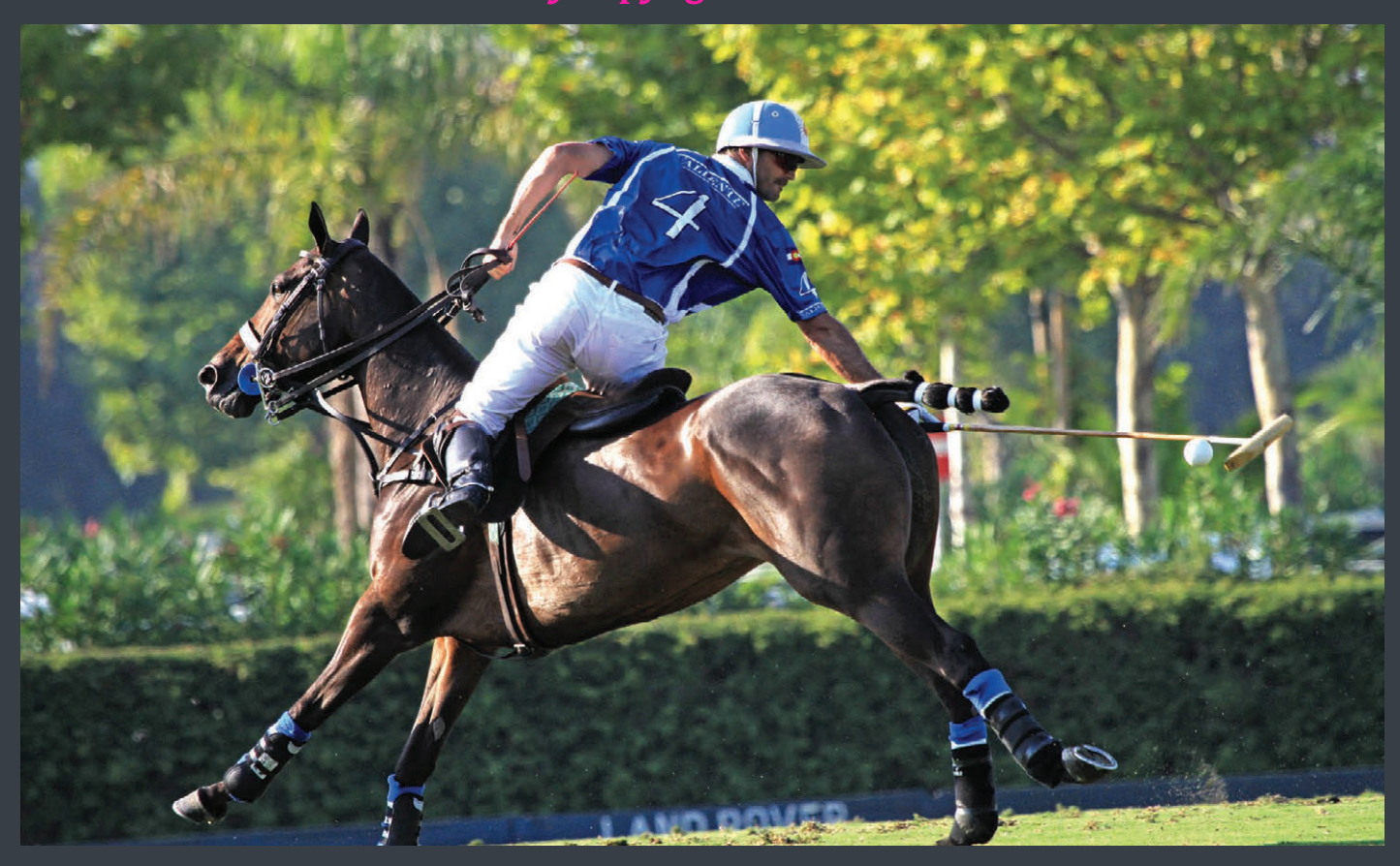
Polo differs from other equestrian disciplines in that it is much more of a consideration of balance and versatility in the saddle, as opposed to conventional riding whereby the horse is driven forward by the rider's seat and back.