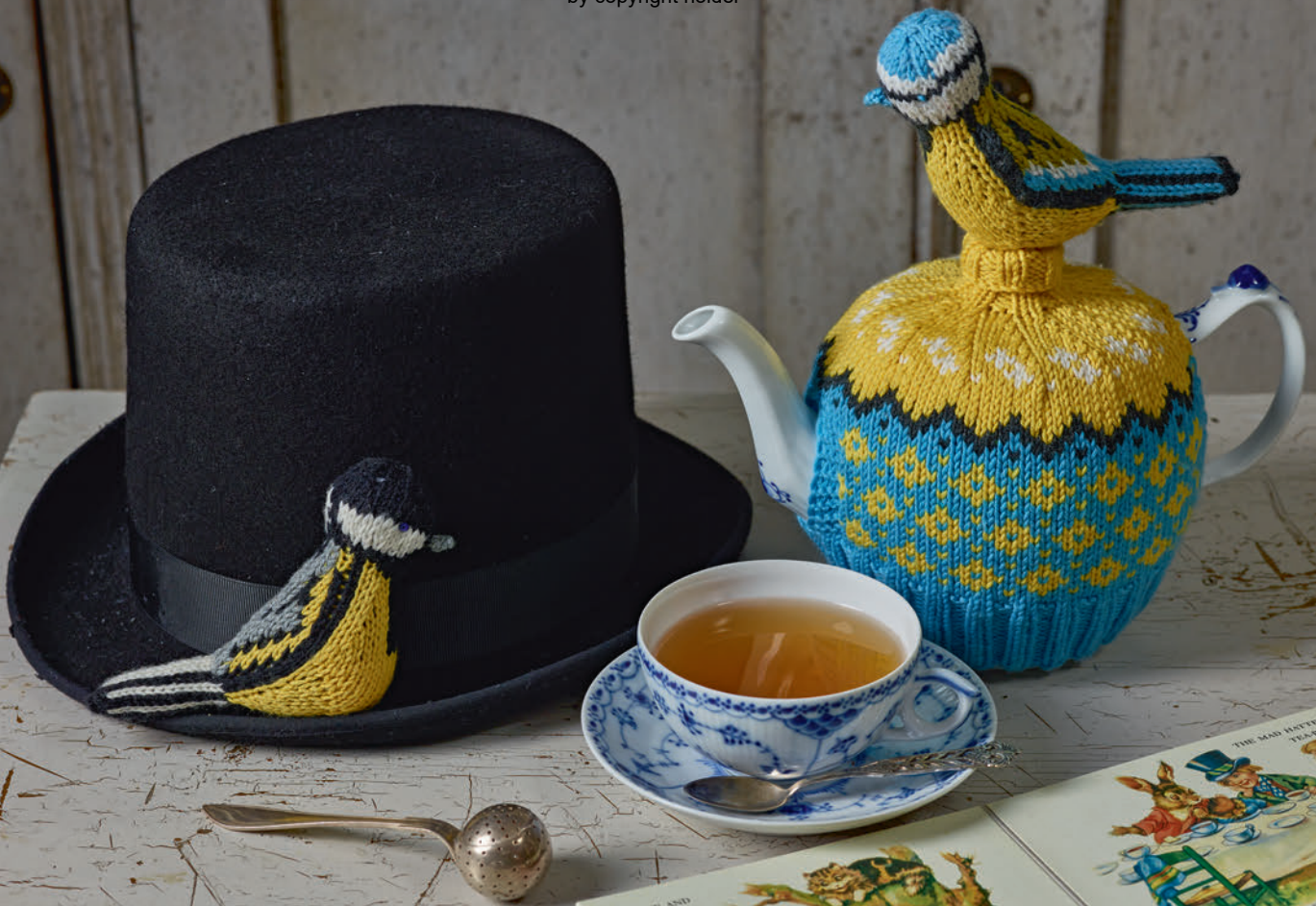
A tea setting inspired by Alice in Wonderland. We placed a bird on the hat and knitted a tea cozy with the colors of a blue tit.