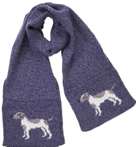
Jack Russell scarf PAGE 110