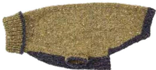
Dog coat PAGE 112