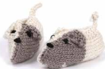
Jack Russell booties PAGE 111