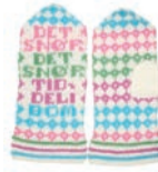
TIDDELY POM, P. 184