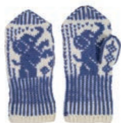
BABY ELEPHANT, P. 203