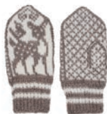
ROE DEER FAWN, P. 114