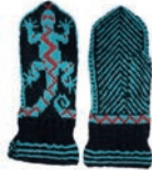
SANDRA SALAMANDER, P.124