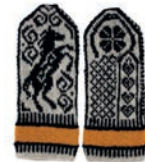
HORSE, P. 138