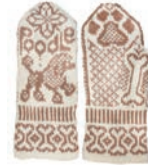
POODLE MITTENS, P. 38