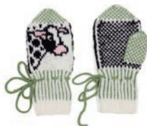
CALF, P. 146