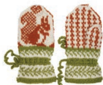
LITTLE SQUIRREL, P. 117