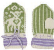
LITTLE LAMB, P. 158