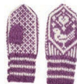
LITTLE BIRD, P. 58