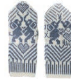
TANGO ELEPHANT, P. 200