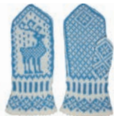
REINDEER, P. 154