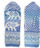
NORTH POLE, P. 132