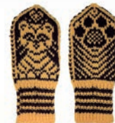
TIGER CUB, P. 194