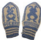
LITTLE RABBIT, P. 30