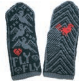
BIRD MITTENS, P. 48