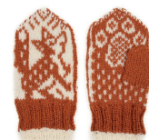
LITTLE FOX, P. 106