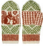
MOTHER SQUIRREL, P. 120