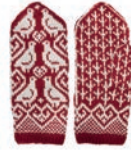
PTARMIGAN, P. 55