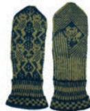
DANCING FROGS, P. 124