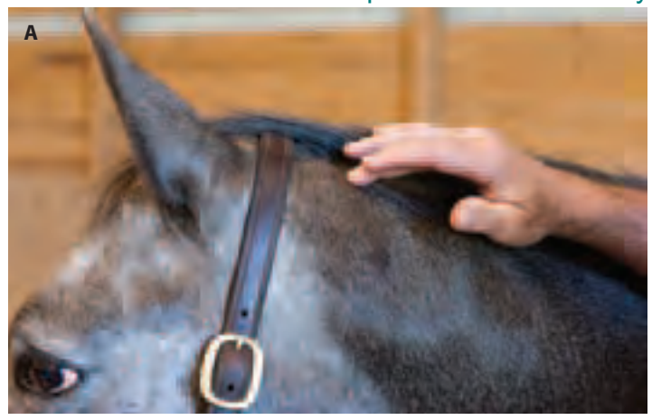
4.3 A Using your fingertip.