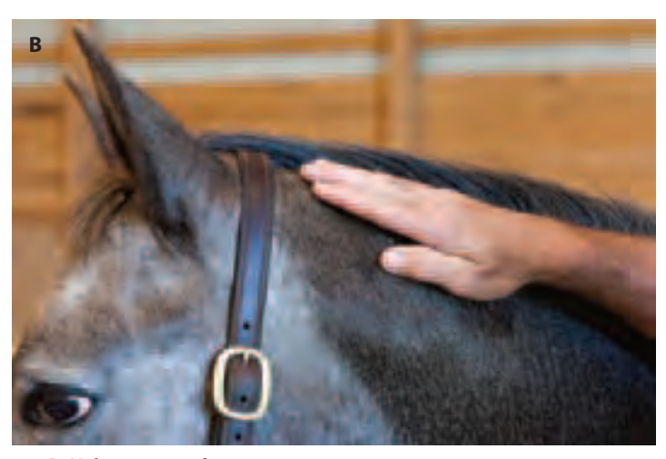
4.3 B Using your palm.