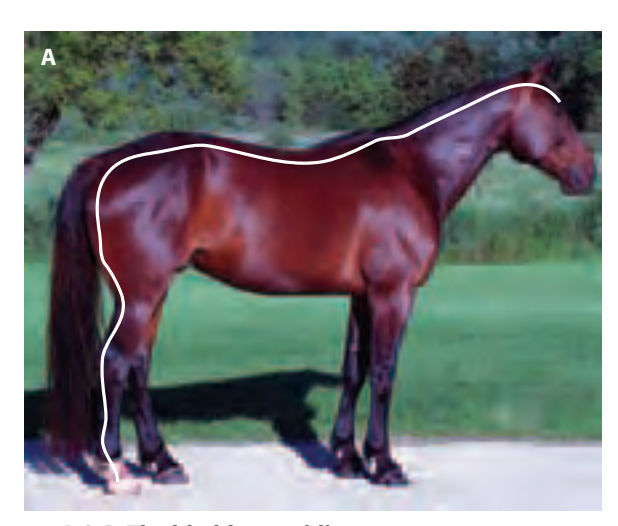
4.1 A & B The bladder meridian.

GOAL: To bypass the horse's survival-defense response and connect directly with the part of the horse's nervous system that holds and releases tension.