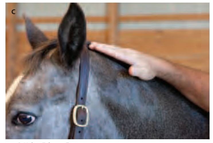
4.3 C Using "air gap" pressure.