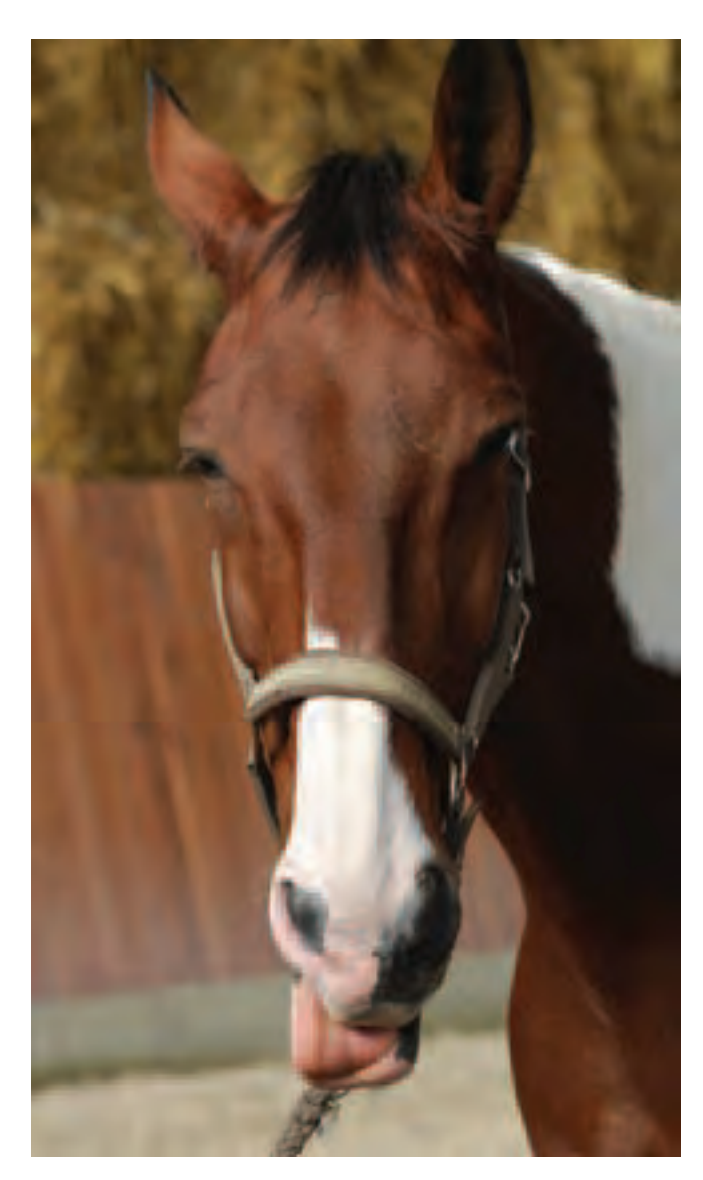
4.5 Not all horses respond the same. Some are stoic at first; others respond immediately.

After doing only a couple of horses you will notice that all horses are different. Depending on the horse and your individual sensitivity, the length of time you spend on the entire Bladder Meridian Technique will vary. Some horses are very stoic and take longer to respond and release. On these horses you have to go slower and pay very close attention to see the subtlest responses. Some show responses but won't release until you move past a spot, or step back away from them. Others start responding immediately (fig. 4.5).