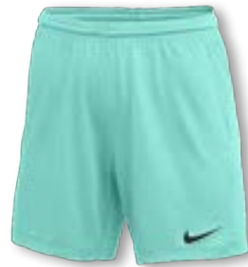
NIKE DRY PARK III SHORT NB BV6862 Page 25