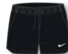
NIKE DRY PARK 20 SHORT KZ CW6154 Page 58