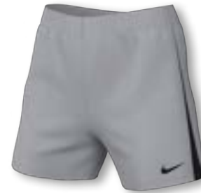
NIKE DF US LEAGUE KNIT III SHORT DR0965 Page 24