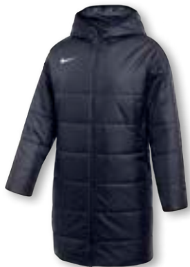
NEW NIKE THERMA-FIT ACADEMY PRO 24 SDF JACKET FD7712 Page 54