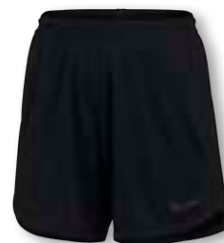
NIKE DF REFEREE SHORT DH8269 Page 35