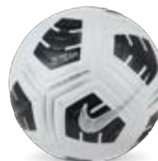
NIKE CLUB ELITE – TEAM CU8057 (NFHS) Page 60