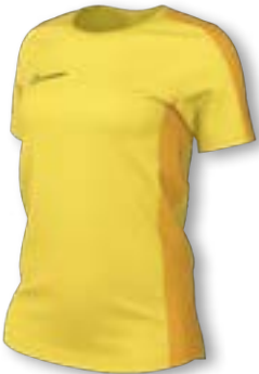
NIKE DF ACADEMY 23 SS TOP DR1338 Page 49