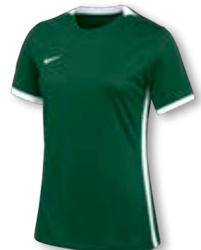
NIKE DF US SS CHALLENGE IV JERSEY DH8231 Page 14