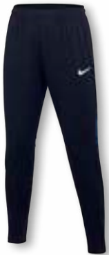
NIKE DF ACADEMY PRO PANT KPZ DH9273 Page 51