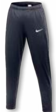
NEW NIKE DF ACADEMY PRO 24 PANT KPZ FD7677 Page 45