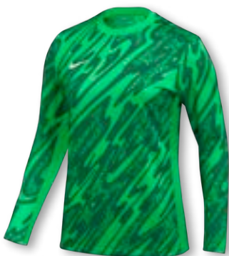
NEW NIKE DF ADV GARDIEN V GK JERSEY US LS FD7479 Page 31