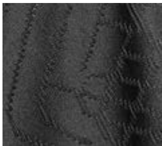
GRAPHIC KNIT DETAIL