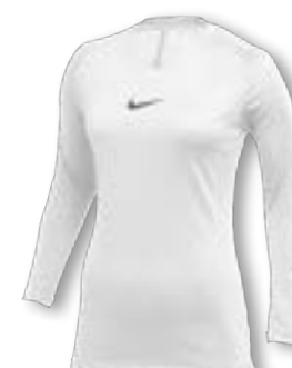
NIKE DRY PARK LS FIRSTLAYER JERSEY AV2610 Page 59