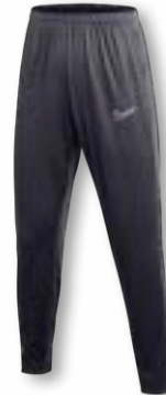
NIKE DF ACADEMY 23 PANT KPZ DR1671 Page 50