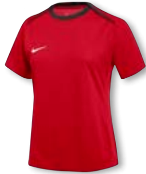
NEW NIKE DF ACADEMY PRO 24 SS TOP K FD7594 Page 46