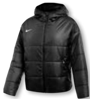
NEW NIKE THERMA-FIT ACADEMY PRO 24 FALL JACKET FD7704 Page 54