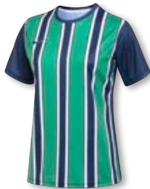
NEW NIKE DF US DIGITAL 24 JERSEY 60D DR2730 Page 26