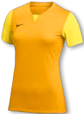
NIKE DF US SS TROPHY V JERSEY DR0940 Page 15