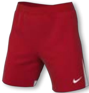
NIKE DF US CLASSIC II SHORT K DH8310 Page 25