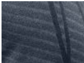
GRAPHIC KNIT DETAIL