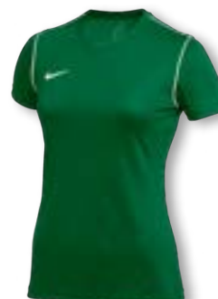
NIKE DRY PARK 20 SS TOP BV6897 Page 58