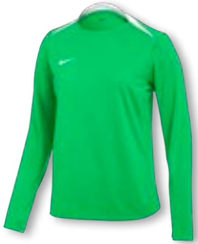
NEW NIKE DF ACADEMY PRO 24 CREW TOP K FD7659 Page 46