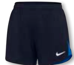
NIKE DF ACADEMY PRO SHORT KZ DH9265 Page 53