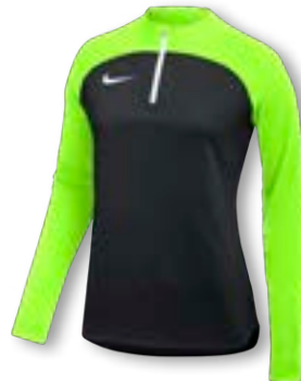
NIKE DF ACADEMY PRO DRILL TOP K DH9246 Page 52