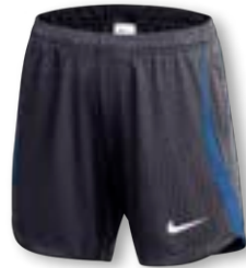
NIKE DF STRIKE 23 SHORT KZ DR2340 Page 43