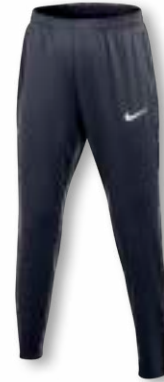
NEW NIKE DF STRIKE 24 PANT KPZ FD7576 Page 38