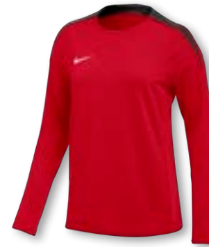
NEW NIKE DF STRIKE 24 CREW TOP K FD7567 Page 39