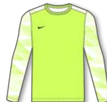
NIKE DRY LS US PARK IV GK JERSEY CJ6071 Page 34