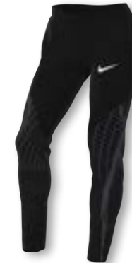
NIKE DF STRIKE 23 PANT KPZ DR2568 Page 42