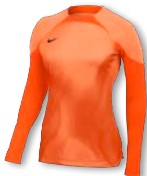
NIKE DF ADV GARDIEN IV GK JERSEY US LS DH8226 Page 32