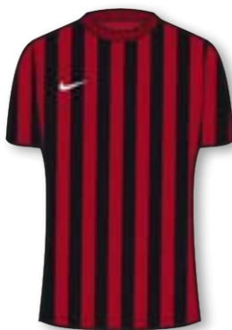
NIKE US SS STRIPED DIVISION IV JERSEY CW3818 Page 16