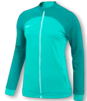
NIKE DF ACADEMY PRO TRACK JACKET K DH9250 Page 51