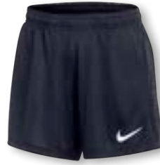
NEW NIKE DF ACADEMY PRO 24 SHORT KZ FD7655 Page 47