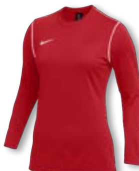
NIKE DRY PARK 20 CREW TOP FJ3006 Page 58