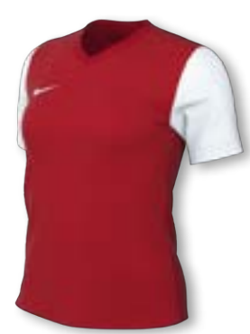
NIKE DF US SS TIEMPO PREMIER II JERSEY DH8235 Page 19