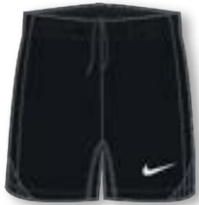
NEW NIKE DF STRIKE 24 SHORT KZ FD7564 Page 40