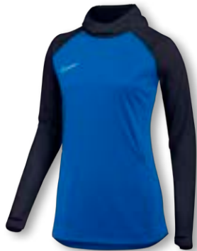
NIKE DF ACADEMY PRO PO HOODIE K DH9248 Page 52