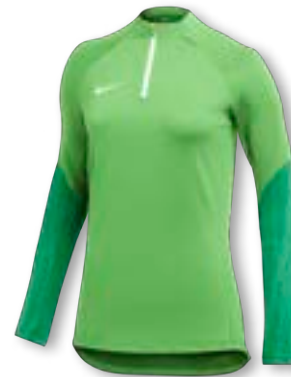
NIKE DF STRIKE 23 DRILL TOP DR2296 Page 42