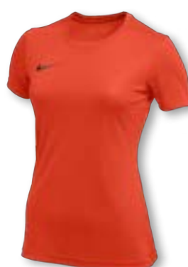
NIKE US SS PARK VII JERSEY BV6730 Page 22