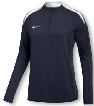
NEW NIKE DF STRIKE 24 DRILL TOP K FD7571 Page 38