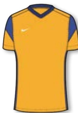
NIKE DRY US SS PARK DERBY III JERSEY CW3832 Page 21