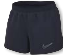
NIKE DF ACADEMY 23 SHORT K DR1362 Page 50