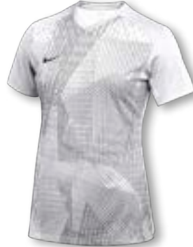
NIKE DF US SS PRECISION VI JERSEY DR0948 Page 12