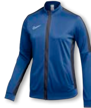
NIKE DF KNIT ACADEMY 23 TRACK JACKET DR1686 Page 48