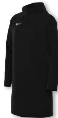
NIKE STORM-FIT ACADEMY HOODED RAIN JACKET DJ6316 Page 55