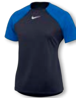
NIKE DF SS ACADEMY PRO TOP K DH9242 Page 53