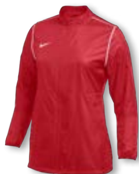
NIKE PARK 20 RAIN JACKET BV6895 Page 57