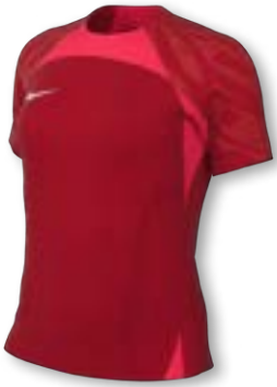
NIKE DF ADV VAPOR IV JERSEY US SS DR0674 Page 10