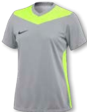
NEW NIKE DF PARK DERBY IV JERSEY SS US FD7437 Page 20