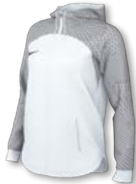
NIKE DF KNIT STRIKE 23 HOODED TRACK JACKET DR2573 Page 41