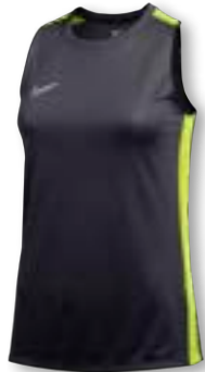
NIKE DF ACADEMY 23 SL TOP DR1332 Page 49