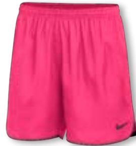
NIKE DF US WOVEN LASER V SHORT DH8302 Page 24