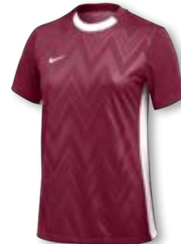
NEW NIKE DF CHALLENGE V JERSEY SS US FD7425 Page 13