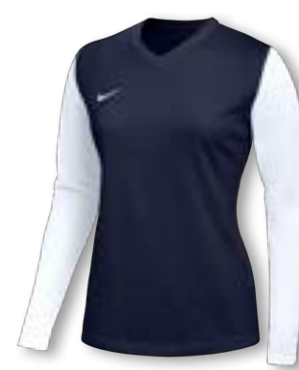
NIKE DF US LS TIEMPO PREMIER II JERSEY DH8236 Page 18