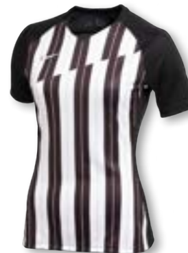
NIKE DRY US SS DIGITAL 20 JERSEY CD6119 Page 27