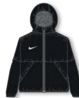
NIKE THERMA REPEL PARK 20 FALL JACKET DC8039 Page 56