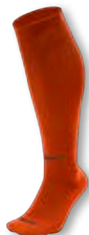
NIKE ACADEMY OTC SOCK SX5728 Page 29