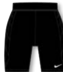
NIKE DF PAD GARDIEN I GK COMPRESSION SHORT CV0055 Page 33