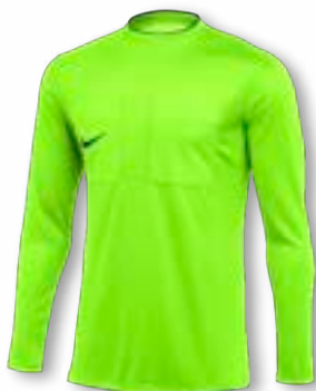
NIKE MEN'S DF REFEREE II LS JERSEY DH8027 Page 35 (MEN'S SIZING. WOMEN'S COMING 1/1/25)