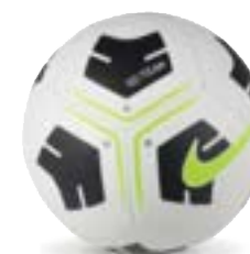
NIKE PARK – TEAM CU8033 Page 60