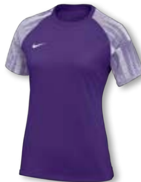
NIKE DF US SS ACADEMY JERSEY DH8232 Page 17