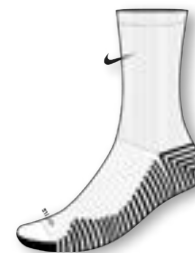
NIKE SQUAD CREW – EC20 SK0030 Page 30