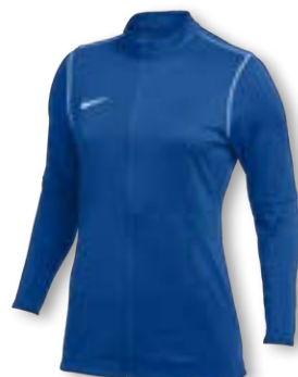
NIKE DRY PARK 20 TRACK JACKET FJ3024 Page 57