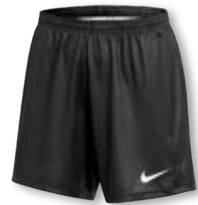
NEW NIKE DF US DIGITAL 24 SHORT 60D FD8772 Page 26