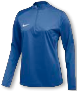
NEW NIKE STORM-FIT STRIKE 24 DRILL TOP FD7589 Page 37