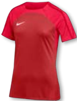
NIKE DF STRIKE 23 SS TOP DR2278 Page 43