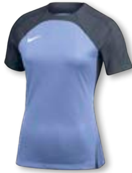
NIKE DF US SS STRIKE III JERSEY DR0910 Page 11