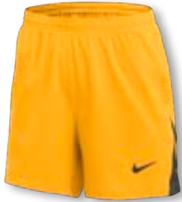
NEW NIKE DF VENOM WOVEN SHORT IV US FD7471 Page 23