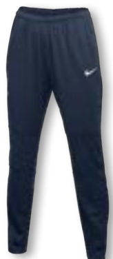
NIKE DRY PARK 20 PANT FJ3019 Page 59