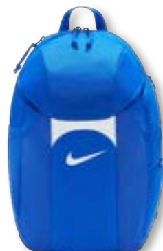
NIKE ACADEMY TEAM BACKPACK 2.3 DV0761 Page 60