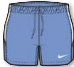
NIKE US WOVEN VENOM SHORT III CW3860 Page 23