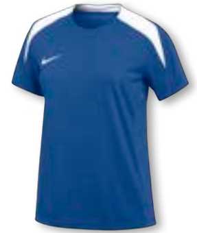
NEW NIKE DF STRIKE 24 SS TOP K FD7490 Page 39