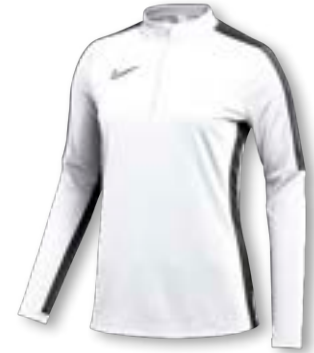
NIKE DF ACADEMY 23 DRILL TOP DR1354 Page 48