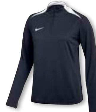
NEW NIKE DF ACADEMY PRO 24 DRILL TOP K FD7669 Page 45