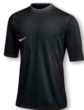
NIKE MEN'S DF REFEREE II SS JERSEY DH8024 Page 35 (MEN'S SIZING. WOMEN'S COMING 1/1/25)