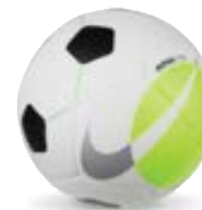
NIKE FUTSAL PRO – TEAM DH1992 Page 60