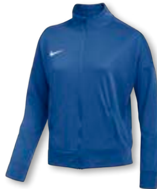
NEW NIKE DF ACADEMY PRO 24 TRACK JACKET K FD7683 Page 44