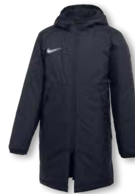
NIKE SYN FL REPEL PARK 20 SDF JACKET DC8036 Page 56