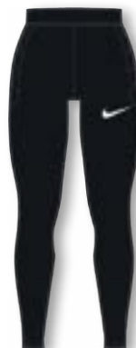
NIKE DF PAD GARDIEN I GK COMPRESSION TIGHT CV0048 Page 33