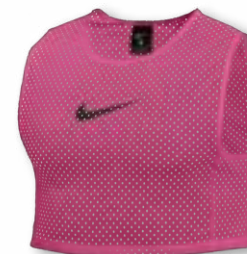
NIKE DRY PARK 20 BIB DV7425 Page 36