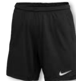
NIKE DRY DIGITAL 20 SHORT CD6120 Page 27