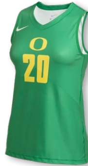
NIKE DIGITAL HYPERELITE SL JERSEY BV1011 Page 12