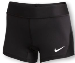
NIKE CUSTOM HYPERELITE SHORT BV1019 Page 15