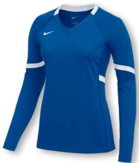
NIKE STOCK ELITE LS JERSEY DJ8626 Page 16