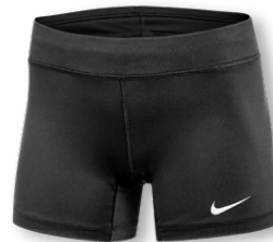
NIKE CUSTOM PERFORMANCE GAME SHORT FD0203 Page 15