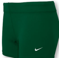
NIKE PERFORMANCE GAME SHORT 108720 Page 22