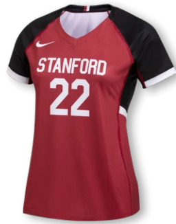
NIKE DIGITAL ELITE SS JERSEY DJ8615 Page 6