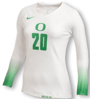
NIKE DIGITAL HYPERELITE LS JERSEY BV1012 Page 11