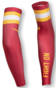
NIKE DIGITAL CLUB ACE ARM SLEEVE CZ1433 Page 10