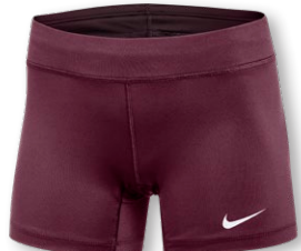
NIKE 5" PERFORMANCE GAME SHORT DV6740 Page 21