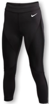
NIKE CUSTOM HYPERELITE CAPRI BV1018 Page 14