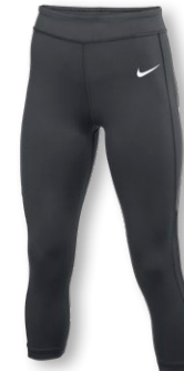
NIKE STOCK CLUB ACE CAPRI CZ1448 Page 20