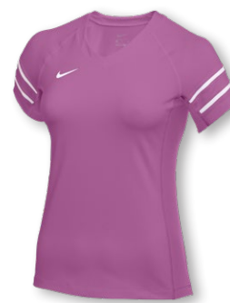
NIKE STOCK CLUB ACE SS JERSEY CZ1432 Page 19