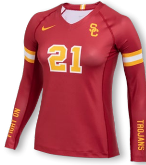
NIKE DIGITAL CLUB ACE LS JERSEY CZ1384 Page 7