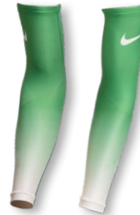
NIKE DIGITAL HYPERELITE ARM SLEEVE BV1015 Page 13