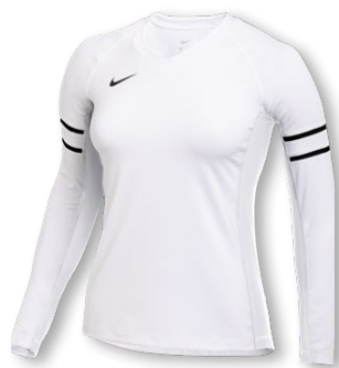
NIKE STOCK CLUB ACE LS JERSEY CZ1429 Page 18