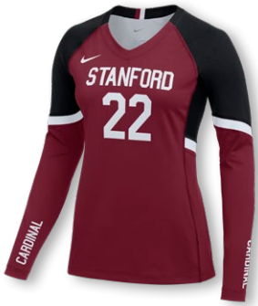
NIKE DIGITAL ELITE LS JERSEY DJ8535 Page 5