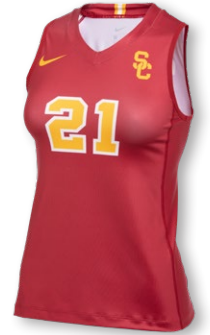
NIKE DIGITAL CLUB ACE SL JERSEY CZ1367 Page 9