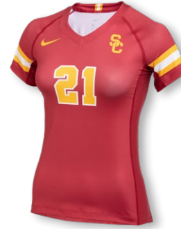
NIKE DIGITAL CLUB ACE SS JERSEY CZ1401 Page 8