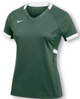
NIKE STOCK ELITE SS JERSEY DJ8627 Page 17