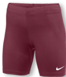
NIKE STOCK HALF TIGHT CV2741 Page 13