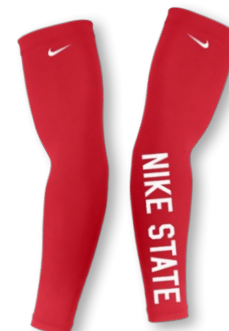
NIKE DIGITAL FAST ARM SLEEVES CW6826 Page 7