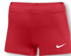
NIKE TEAM STOCK BOY SHORT CV2729 Page 13