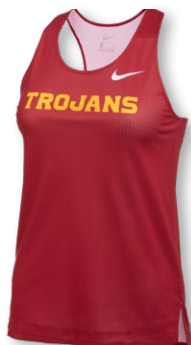
NIKE DIGITAL FAST SINGLET CV3620 Page 8