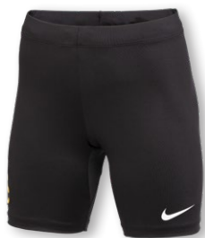
NIKE CUSTOM FAST HALF TIGHT CV3176 Page 9