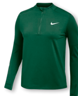
NIKE DRI-FIT ELEMENT 1/2-ZIP TOP DH4951 Page 17