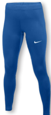
NIKE TEAM STOCK FULL-LENGTH TIGHT CV2730 Page 12