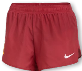
NIKE DIGITAL FAST SHORT CV3606 Page 8