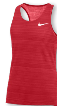
NIKE STOCK DRY MILER SINGLET CV2804 Page 14