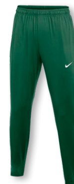
NIKE DRI-FIT ELEMENT PANT DH5183 Page 18