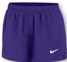
NIKE TEAM 10K RUNNING SHORT DH8121 Page 15