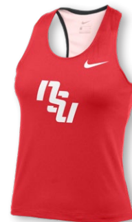
NIKE DIGITAL FAST AIRBORNE TOP CV3647 Page 7