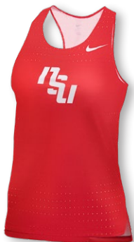
NIKE DIGITAL ELITE FAST SINGLET CV3599 Page 5