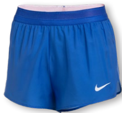
NIKE DIGITAL ELITE FAST SHORT CV3444 Page 5