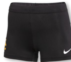
NIKE CUSTOM FAST BOY SHORT CV3094 Page 10