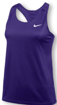
NIKE TEAM RUNNING SINGLET DH8126 Page 15