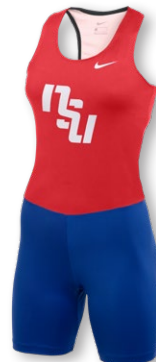
NIKE DIGITAL FAST UNITARD CV3665 Page 6