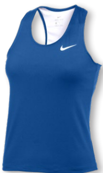
NIKE TEAM STOCK AIRBORNE TOP CV2733 Page 12