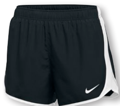
NIKE WMNS DRY TEMPO SHORT 849585 Page 16