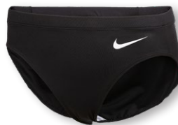
NIKE CUSTOM FAST BRIEF CV3168 Page 10