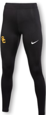
NIKE CUSTOM FAST FL TIGHT CV3668 Page 9