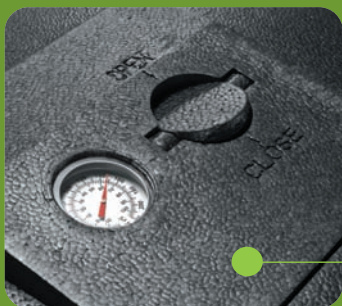
Fig 4b Fixture plate close up with rotating aeration valve set to minimum

Fig 10 Internal base plate with holes in