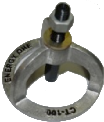
↑ Compression Tool