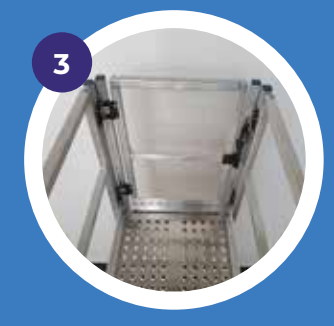
3 Gate gives access to work surface off the end or either side.