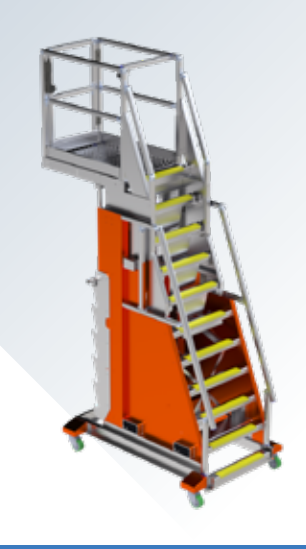
Monkey CAHP-MBC Shown with CAHP-M4B Go Base