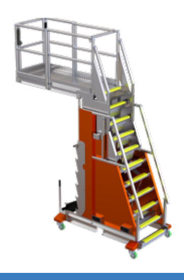
Monkey CAHP-MBC Shown with CAHP-M4B Go Base, CAHP-MECD extended cantilever deck & CAHP-MHK hydraulic kit