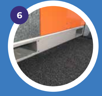
Easy to load and transport with forklift pockets in chassis.