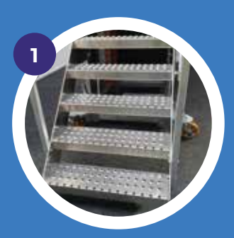
Efficient to climb with constant grade stair at any platform height.

The Giraffe can nose its way into many different situations, giving comfortable, constant grade stair access. The wide, flat deck makes previously awkward, dangerous and time consuming jobs easy, safe, and very efficient.