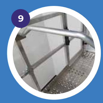
Prevent falls down the stair with the firm safety bar.