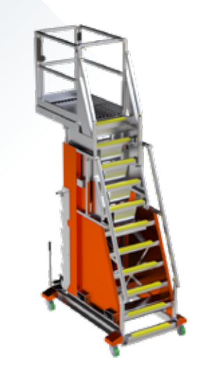
Monkey CAHP-MBC Shown with CAHP-M4B Go Base & CAHP-MHK hydraulic kit