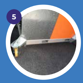
Minimal floor footprint that remains the same for all platform heights.