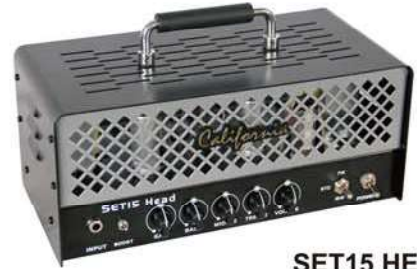
SET15 HEAD All-tube guitar amp head

5W all-tube guitar amp head 3-way switchable power attenuator: 1W and 0.1W Single-ended Class A tube circuit 12AX7 preamp tube EL84 power amp tube Controls: Bass, Treble, Volume Heavy duty metal enclosure Size: 205mmx135mmx132mm Weight: 3.4kg