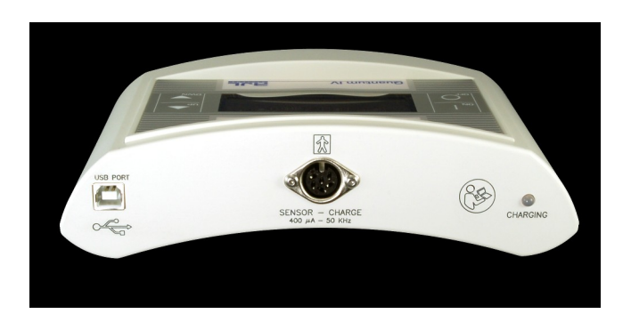
Quantum IV rear panel: USB port, subject and charger input connector with battery charging status indicator

An optional solar panel that folds up for travel is available for environments in which electric power is not available.