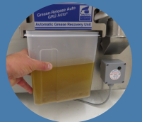
Recycle Waste Oils