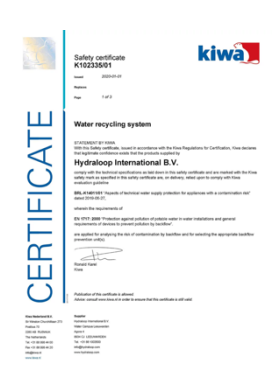
For more information, please visit www.hydraloop.com