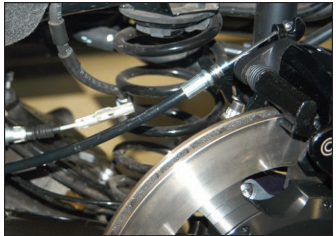
Photo 2. Installation of Cable to Wilwood Combination Parking Brake Caliper