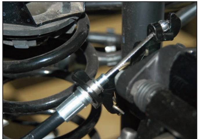
Photo 3. Installation of Cable to Wilwood Combination Parking Brake Caliper