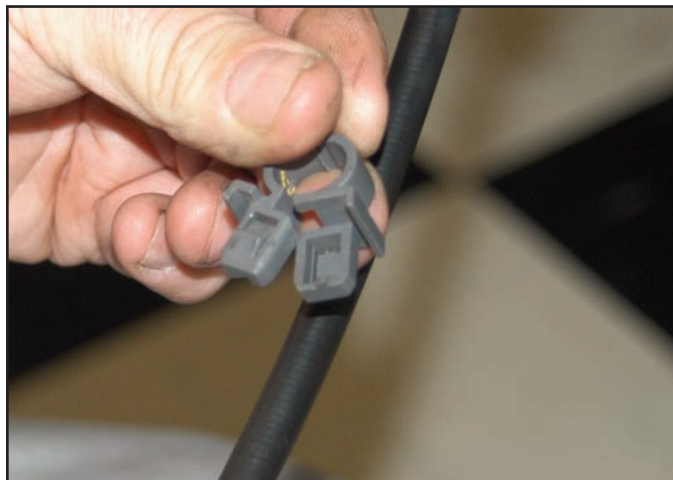
Photo 1. Remove and Save the OE Brackets