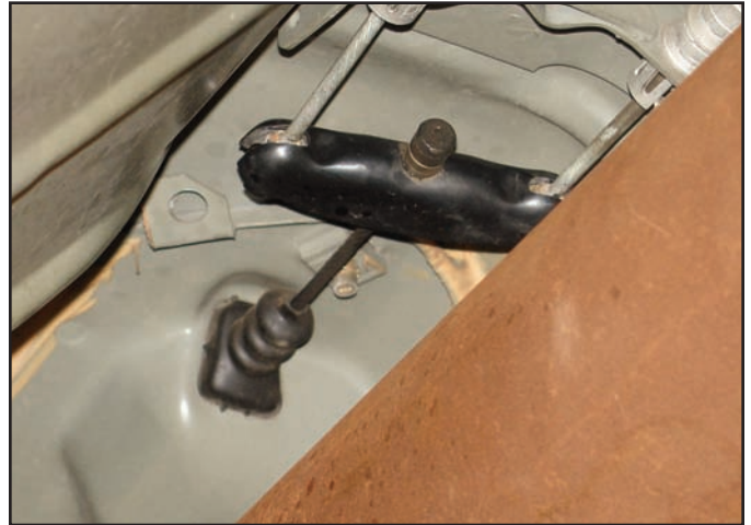
Photo 3. Installation of Cables to Balance Bar End