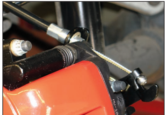
Photo 2. Installation of Cable to Wilwood Combination Parking Brake Caliper