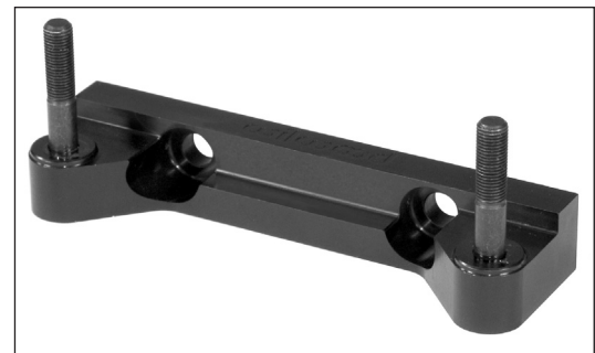
DynaPro Caliper Mounting Bracket P/N 250-9595