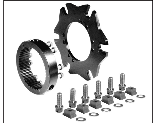
Axle Clamp, Rotor Adapter, & Bolt Kit • P/N 270-9761