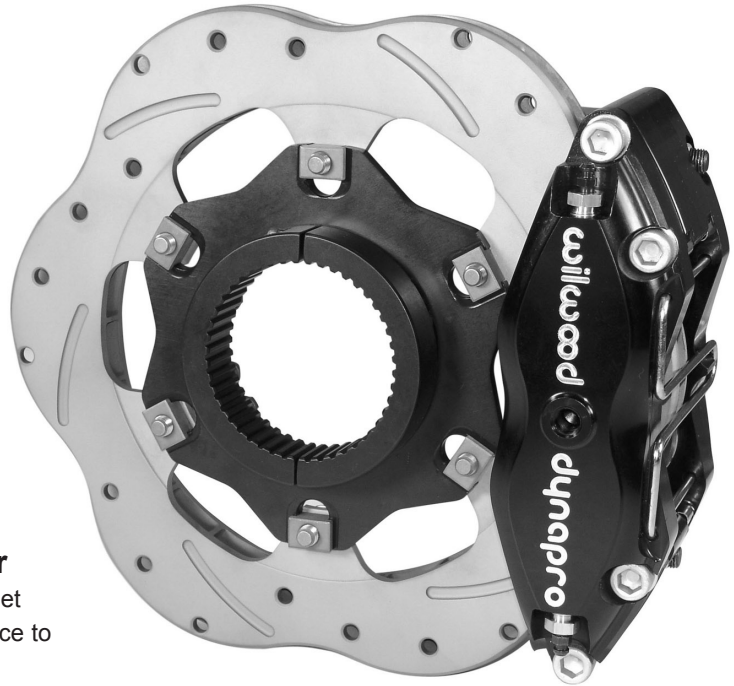
Inboard Rear Brake Kit with DynaPro Caliper and Dynamic Mount PolyMetallic Titanium Rotor