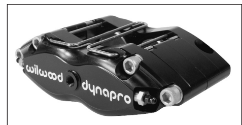
DynaPro Caliper • P/N 120-8544-SI