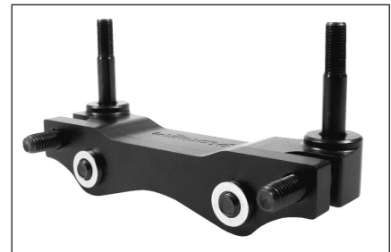
Powerlite Caliper Mounting Bracket