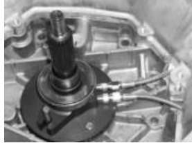
Bearing/collar in place

Remove the factory bearing from the front of the transmission. Install the RAM collar and spacer using the supplied M6 bolts. Install the drive stud in the RAM collar. Slide the bearing over the collar.