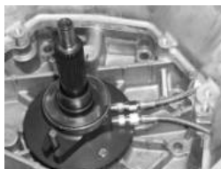
Bearing/collar in place

Remove the factory bearing from the front of the transmission. Install the RAM collar and spacer using the supplied M6 bolts. Install the drive stud in the RAM collar. Slide the bearing over the collar.