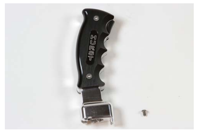
1. Ensure your product includes parts shown above.

NOTE: For ease of access, set ignition to "ON" as you complete the following installation step.