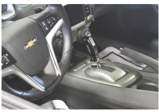
Congratulations, the installation of your Hurst Pistol Grip Shifter Handle is now complete!