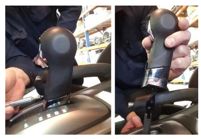
3. Remove screw from front of shifter handle then remove handle.