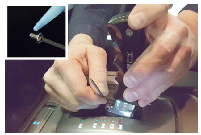
5. Apply loctite to screw (2) then install it into front of shifter handle.