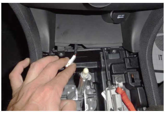
NOTE: Challenger models do not require this step.

Route harness to driver side of shifter housing. Place stock handle into empty space in front of shifter housing under tray (removed step 11). Challenger models have an empty space just forward of shifter housing.