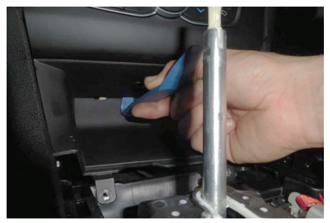
NOTE: Challenger models do not require this step.

12. Pull straight back on upper part of storage tray to release clips. Remove tray from console.