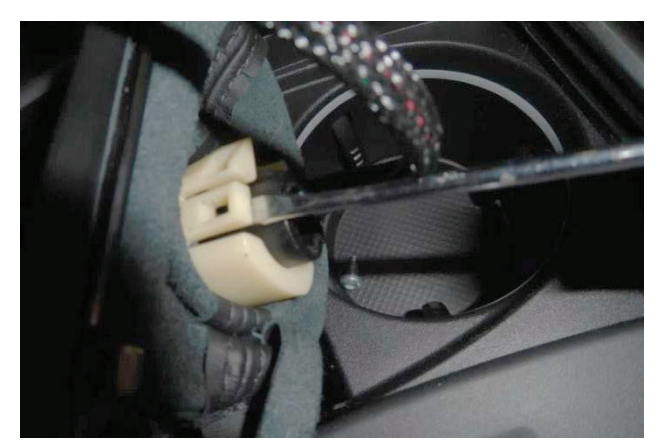
8. Release clips (x2) that mount shift boot retaining collar to shift handle.