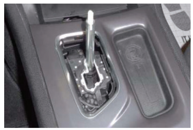
16. Reinstall factory bezel.

15. Reinstall lower tray, ensuring wire harness is routed through opening shown.