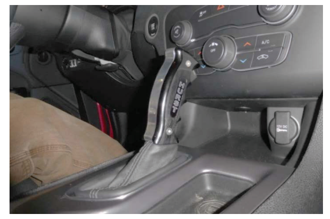
Congratulations, the installation of your Hurst Pistol Grip Handle is now complete!

19. Slide pistol grip about halfway down shift rod. Run set screw in until it bears lightly on shift rod. This assists in aligning set screw with dimple on shift rod. After it is aligned, tighten screw fully.