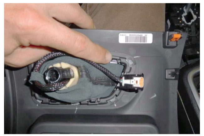
6. Release clips (x4) to remove shift boot and factory handle from bezel.