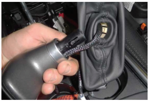
9. Separate shift boot from shift handle and wire harness.