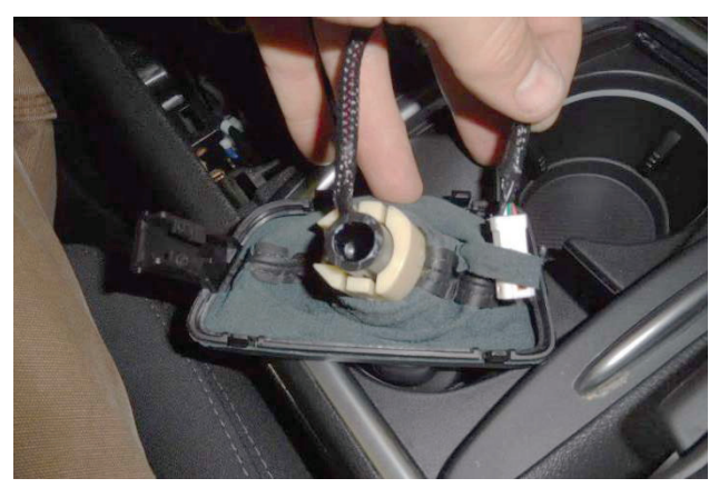
7. Detach shift handle wire harness from mount on shift boot then pull it through boot loop.