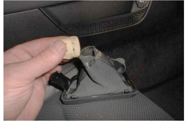
10. The shift boot collar is attached to shift boot with glue. Separate collar from boot, being cautious not to tear boot.