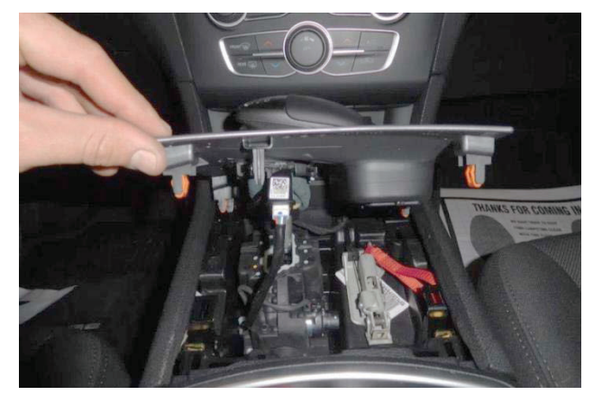
4. Lift up on bezel then unplug shift handle harness connector.

3. Pry up front corners on console bezel then work your way around it to release remaining clips.