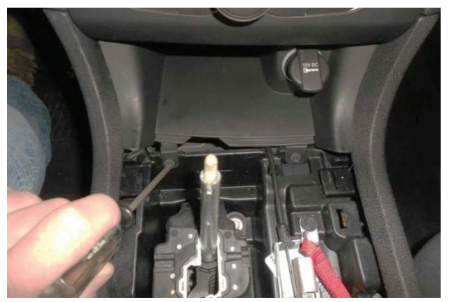
NOTE: Challenger models do not require this step.11. Remove screws (x2) from front console storage tray.