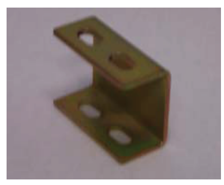
Front bumper inner bracket