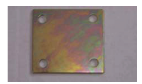
Rear bumper outer bracket