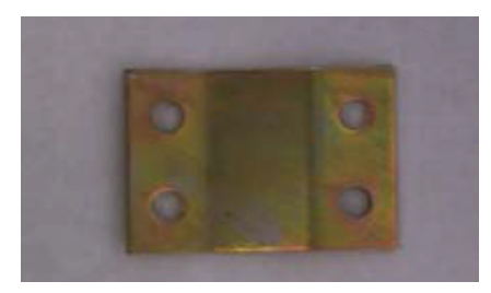
Front bumper outer bracket