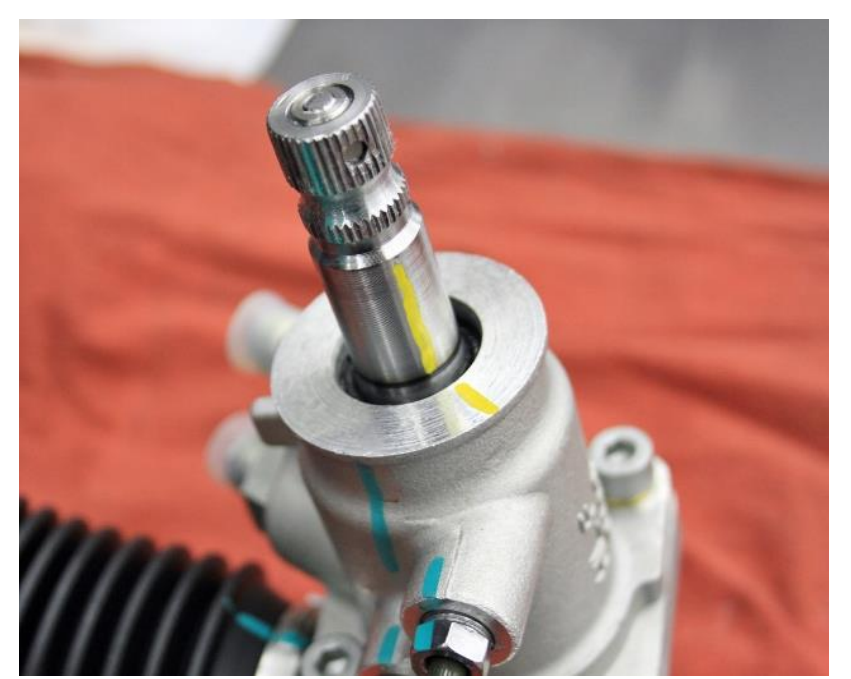
Figure 1 - Center the Rack & Pinion

NOTE: Before the rack and pinion is installed, you can center the rack on the bench before it is installed. Mark a line along the length of the input shaft. Turn the rack all the way to one side and mark the housing where the line on the input shaft lines up. Turn the rack all the way in the other direction and count the turns in the opposite direction. Mark the housing where the line on the input shaft lines up. Turn the rack back in the opposite direction 1/2 the amount of turns so that the line on the input shaft lands in between your 2 marks on the housing (Figure 1).