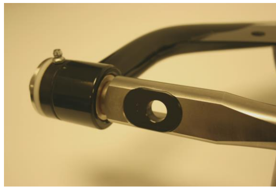
Figure 6 – Bushing Installed

Camber should be adjusted by using shims provided by the alignment shop and placed between the frame attachment and cross shaft if needed.