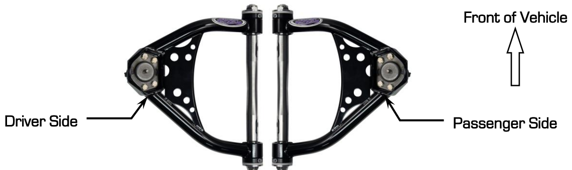
Figure 2 - LH and RH orientation