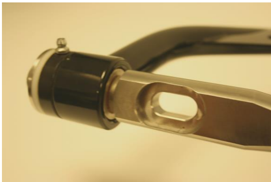
Figure 5 – Bushing Removed

Additional caster adjusters are supplied at no charge for caster adjustment if needed. Installing the caster adjuster with the attachment hole forward in the control arm will position the entire control arm rearward in car and create additional positive caster. The same adjusters can be rotated 180° for the opposite effect on caster. Finally, the second set of caster adjusters you have received (labeled “2”) can be used for additional caster or can be used for minimum caster. Figure 5 below shows the bushing removed and Figure 6 shows the bushing installed.