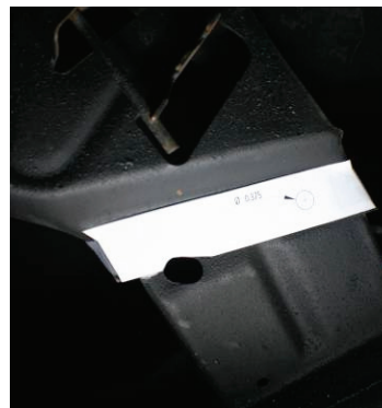
Figure C Line up template with edge of bracket

With the help of an assistant to support the deck lid, install the four 5/16-18 x 3/4" stainless button head cap screws with 5/16" flat washers to attach the deck lid to the hinges. Align deck lid to vehicle, then tighten fasteners firmly. Finish installation by pressing hinge caps into place.