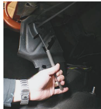
Figure A Torque Rod Removal