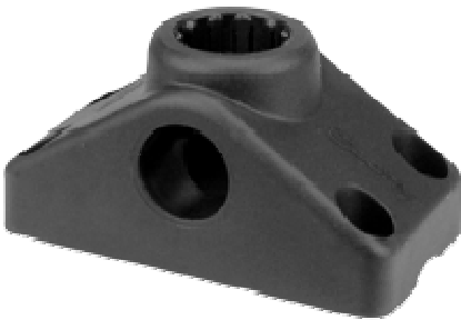
Scotty #241 Side/Deck Mount