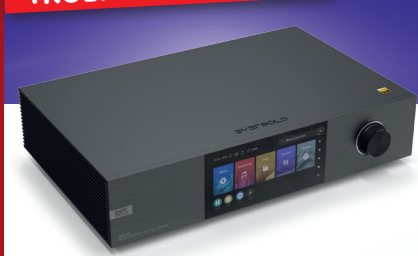
Eversolo's do-it-all DMP-A8 streamer/DAC/preamp