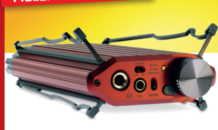
iFi Audio's iDSD Diablo 2 DAC/headphone amp