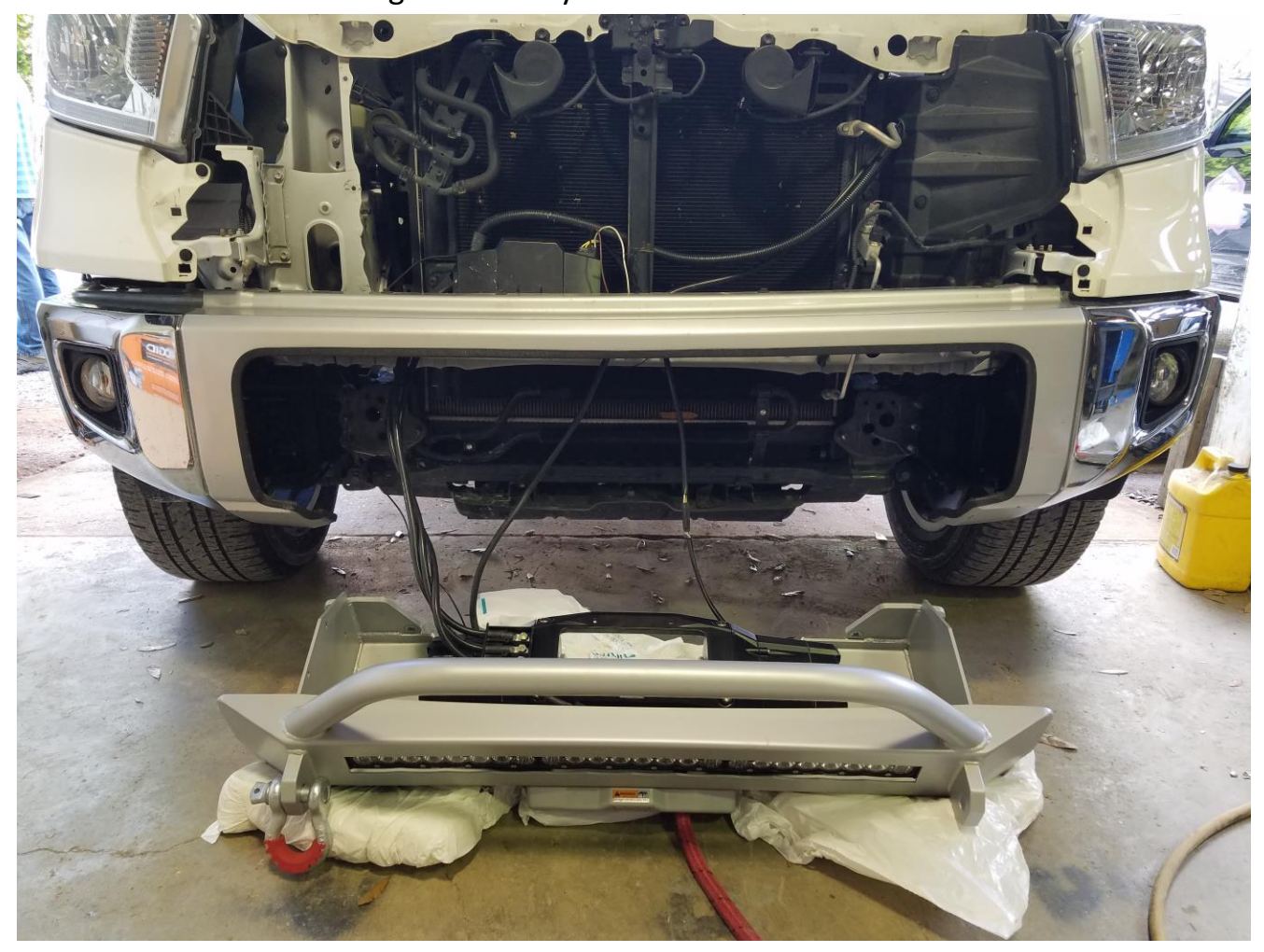
Also install the edge trim around all cut surfaces. You may need to snip any remaining portion off.

Using the packing material from the box, make an area to rest the bumper on its face while you install the winch, lights, or other accessories. The lines should be long enough to directly install to the truck as well.