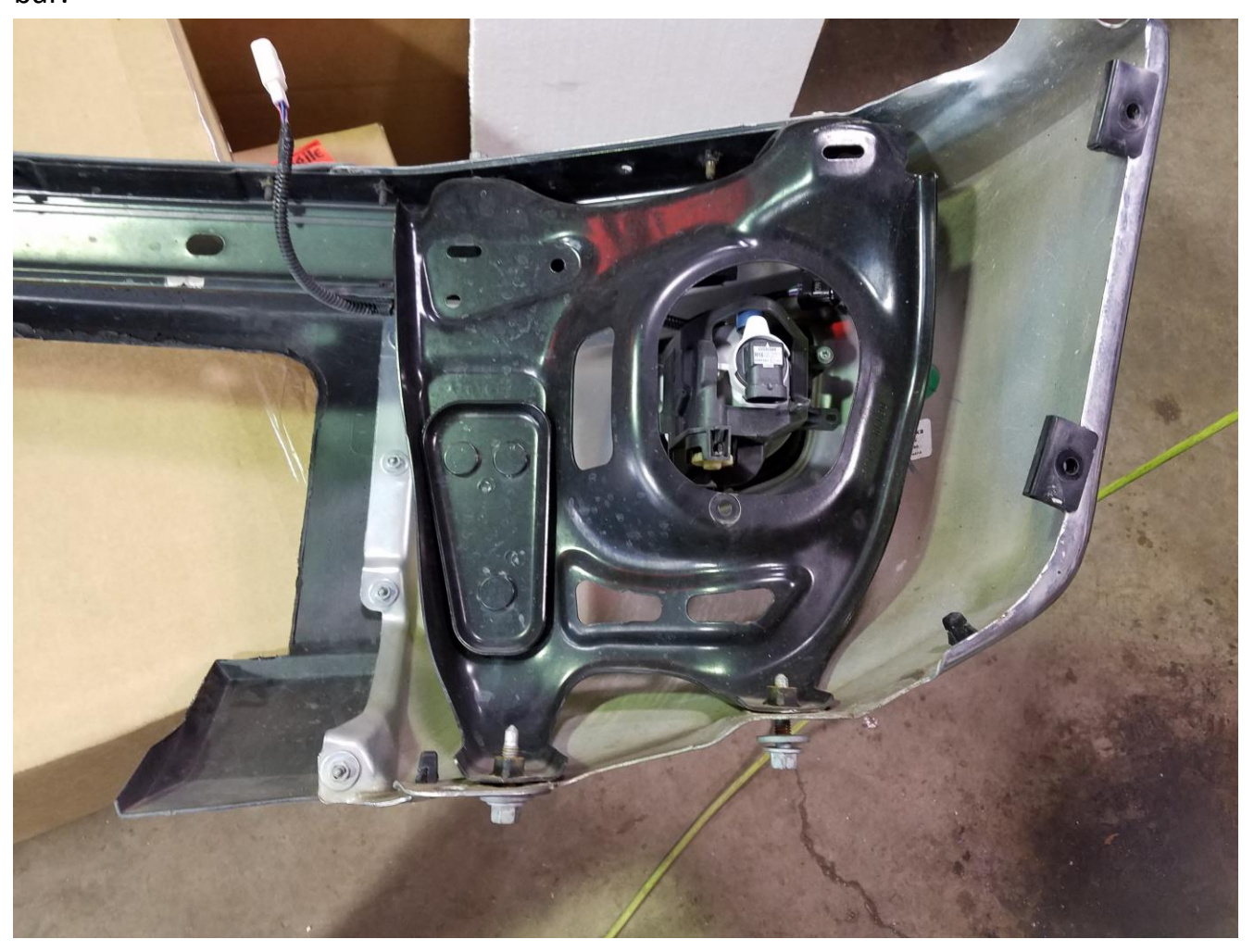
Also, reattach the fender liners back to the oem assembly. We'll be using that clip location to help us secure the bumper for a few minutes while installing the Slimline hybrid.

Reattach the side brackets back to the bumper assembly. Discard the aluminum crash bar.