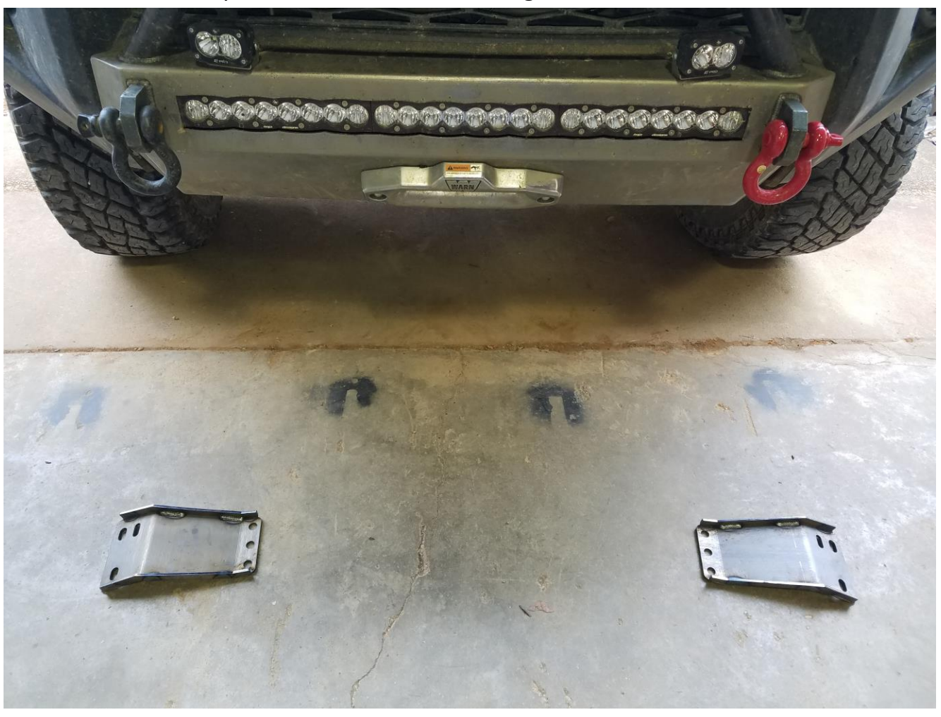
This picture shows the left and right bracket difference.

Slide these into place from up and under and tighten the 3 vertical bolts first, generally square to the bumper. The adjustability in the slots should allow for plenty of movement for the perfect alignment, however you can loosen the 3 vertical bolts for even more adjustability up or down on each side.