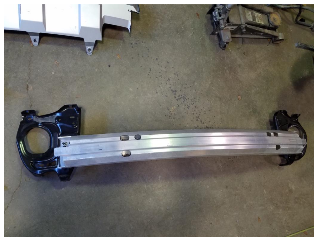
Remove the side brackets using a 14 mm socket.

Next, we need to remove the aluminum crash bar from the bumper assembly. To do that, begin by unbolting the side brackets from the bumper until all you're left with is the aluminum crash bar and side brackets.