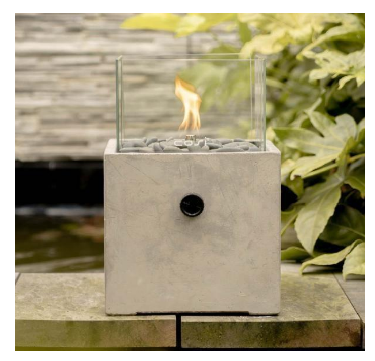
Box Contents: LANTERN, PEBBLE STONES