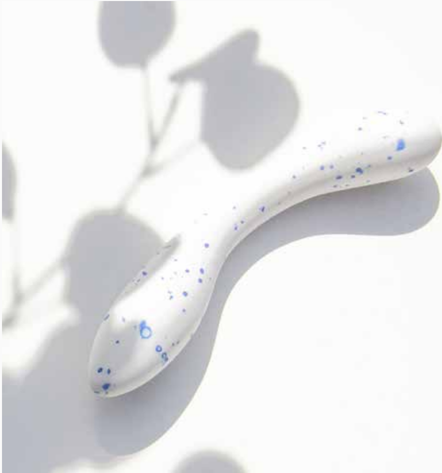
LOVE DUST Retail Price : 156$