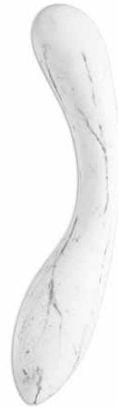
MARBLE Retail Price : 160$