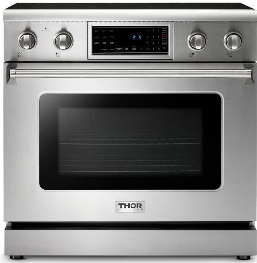
Product: 30 Inch Tilt Panel Professional Electric Range Model Number: TRE3601