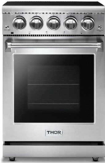
Product: 24 Inch Professional Electric Range in Stainless Steel Model Number: HRE2401