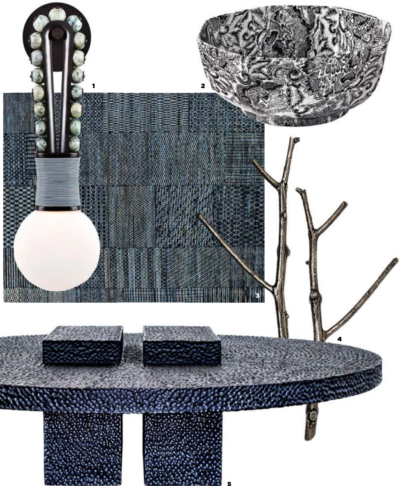
1. 'Talisman Loop' sconce with grey jade, ₹3,84,000, APPARATUS. 2. 'Faded Peony' (black) octagonal bowl from the Ralph Lauren x Burleigh collection by Ralph Lauren Home, Seetu Kohli Home. 3. 'Fields (Forged Iron)' (4x6 feet) hand-knotted wool carpet, ₹38,400, Mishcat Co. 4. 'Branch' door pulls (pair), ₹1,50,000, Taannaz. 5. 'R3' hand-shaped maple hardwood coffee table, ₹14,43,000, John Eric Byers.