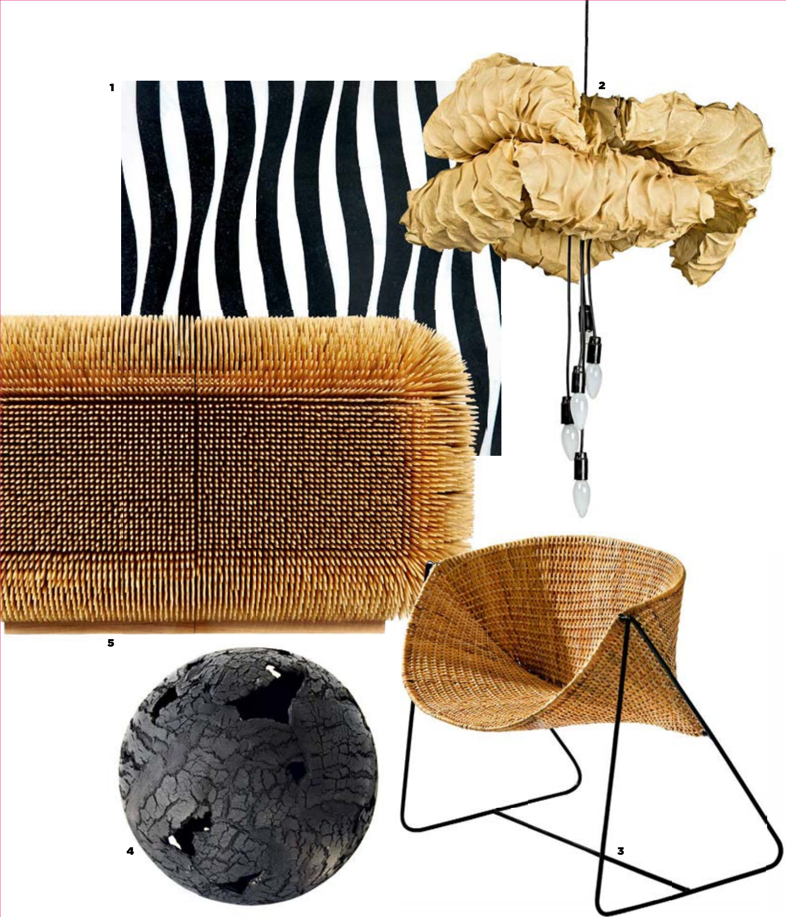
1. Black limestone and mother-of-pearl inlay tile from the Lusso collection, ₹6,000 per square foot, Topstona. 2. 'Double Passion Flower' hand-sculpted banana-paper lamp (small), ₹45,158, Oorjaa. 3. 'Lifafa' chair, ₹25,000, PRELAB DESIGN STUDIO. 4. 'Parched Earth, Potent Life' ceramic object, ₹10,000, Shweta Mansingka. 5. 'Magistral' cabinet with maple hardwood, bamboo, plywood and metal hardware by Sebastián Errazuriz, R & Company.